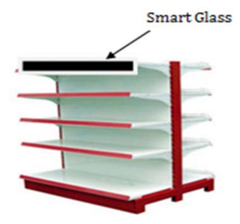
Fig. 3. Proposed smart glass.

keep up an appropriate record of the items present there is need of the "Brilliant glass". Shrewd glass is a gadget which will help the shopping center power with keeping up the number of items, illuminating the power, the director of shopping center and the sellers of the particular item if the amount goes underneath the limit level. Keen glass contains a RFID peruser which will include the quantity of items one take, keep a record and upgrade in database in like manner. Inventory is very helpful to owner as well as vendors also this inventory give indication to the customers products are available or not. With the help of inventory mall management team automatically get the alert if the product is less than the threshold. So if such condition is occurs one message will send to vendors then vendor pass the products to smart mall. This application provides a very high efficiency in supermarket.