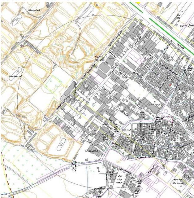
Picture 2. map of Pakdasht

This town as one of the most important towns of Tehran is