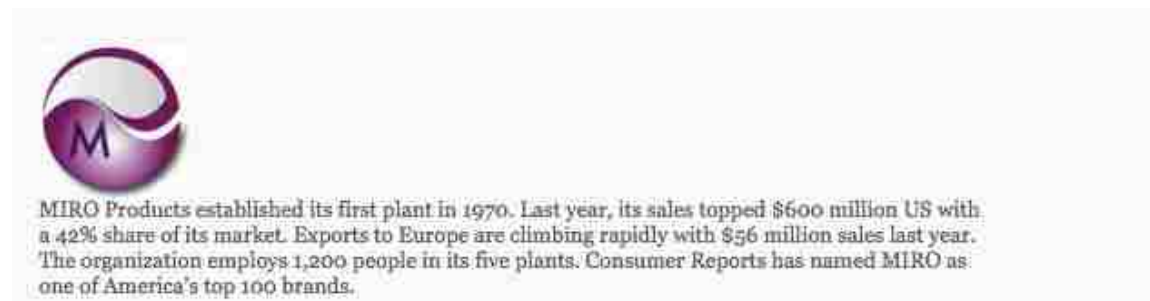
Figure 10: Company History

b. Response (non-human voice)- @Shay, Miro takes customer's concerns seriously. Miro promises exceptional working conditions, clean and safe facilities, and a competitive benefits package. Is there a specific problem?