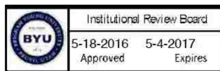
Figure 9. Consent Agreement

If you have any questions about your rights as a research participant you may contact the IRB Administrator at A-285 ASB, Brigham Young University, Provo, UT 84602; irb@byu.edu ; (801) 422-1461. The IRB is a group of people who review research studies to protect the rights and welfare of research participants.