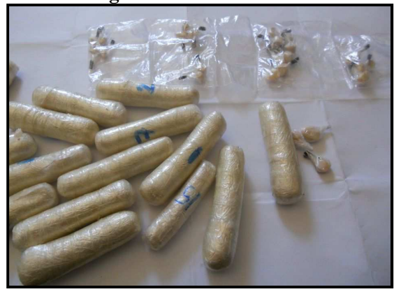
Figure 3. Photo of heroin

"It can make you feel high, sleeping whole day, standing up sleeping... If it move from in you now, that's the time you can get active to go look for money again." – Substance User 207, Male, Age not available