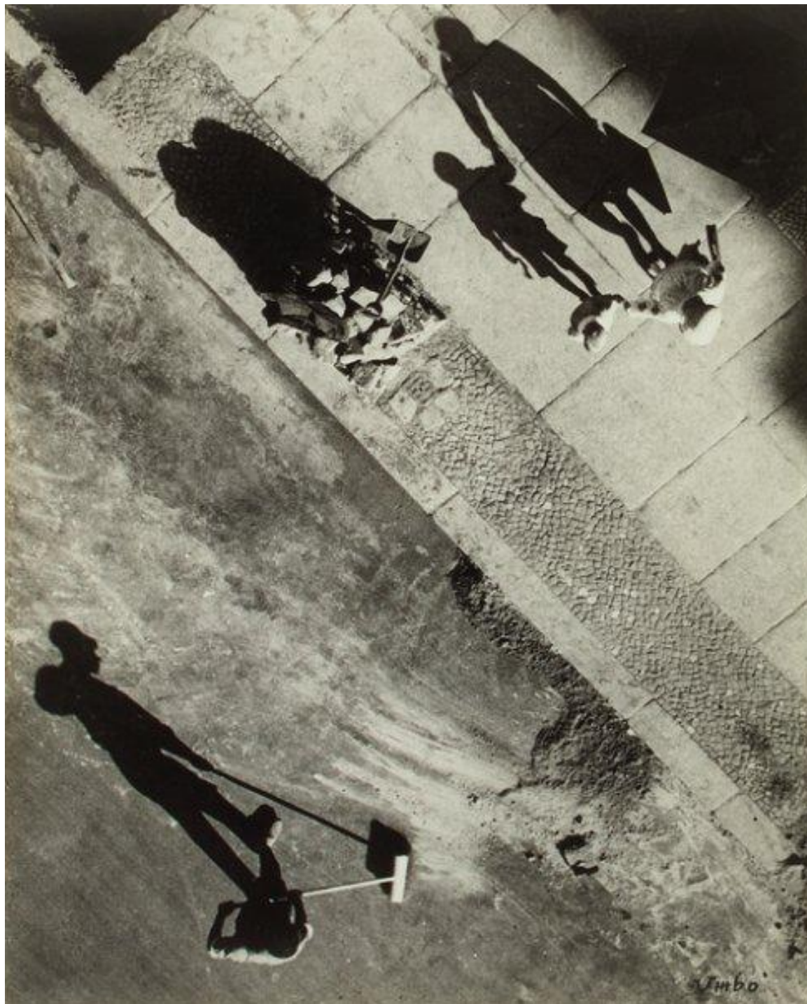
Mysterium Der Strasse (Mystery of the Street) . 1928. Otto Umbehr.