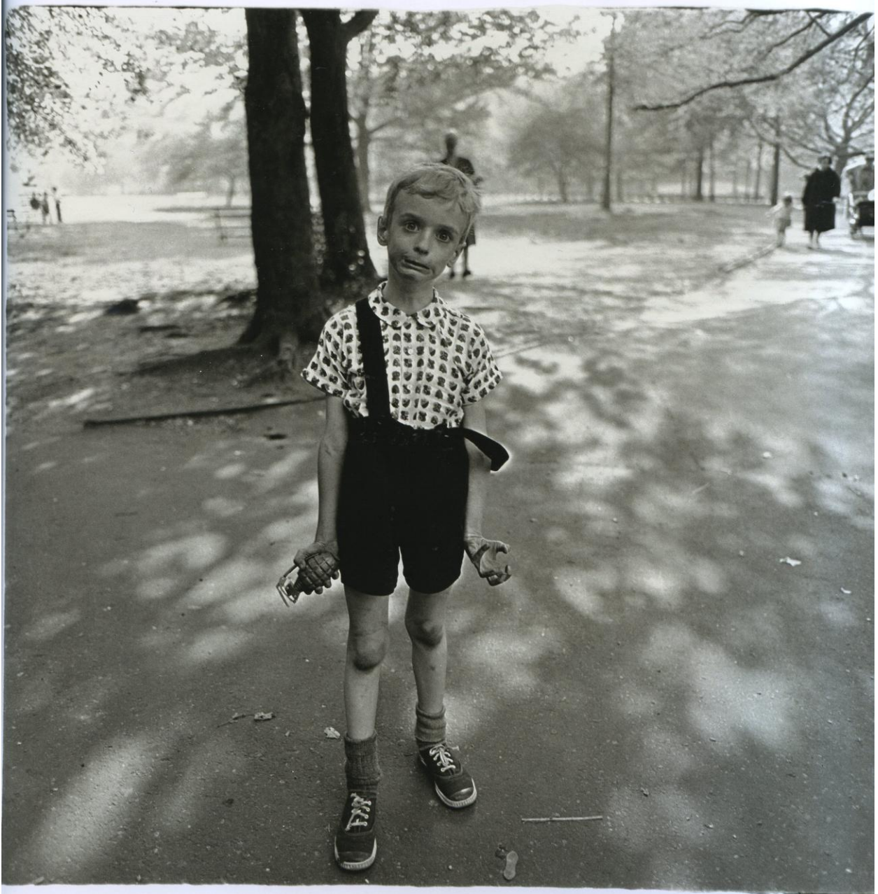
Child with a Toy Grenade in Central Park. 1962. Diane Arbus.