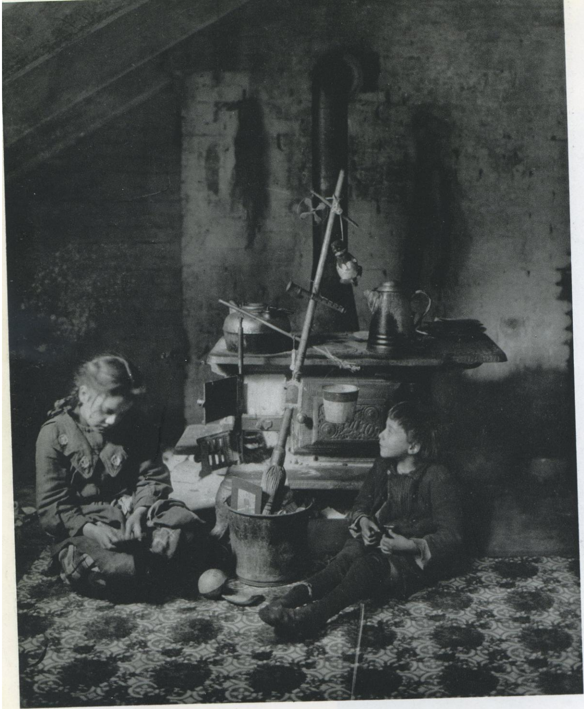
East Side Tenement Christmas. Unknown.