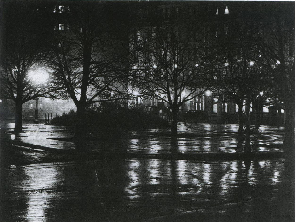
Reflections, Night, New York. 1896-97. Alfred Stieglitz.