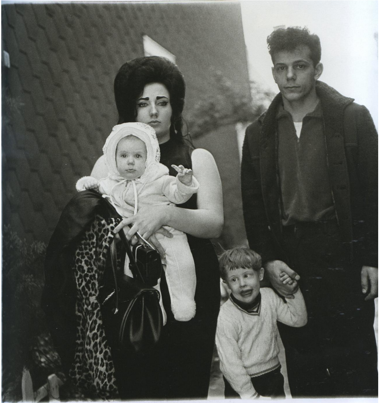
A Young Brooklyn family Going for a Sunday Outing. 1966. Diane Arbus.