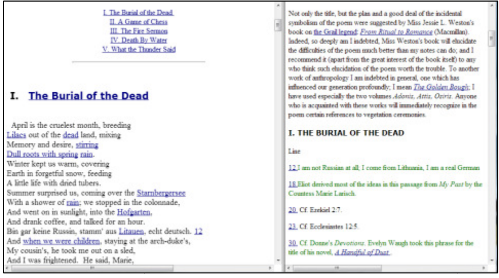
Figure 1 Example of a site using frames to display annotations

the text being annotated is displayed in one frame (a bounded, window-like rectangular region of the screen), while the available notes are shown in another frame above, below, or beside the central text (see Figure 1 for an example). As the amount of information to be displayed in the