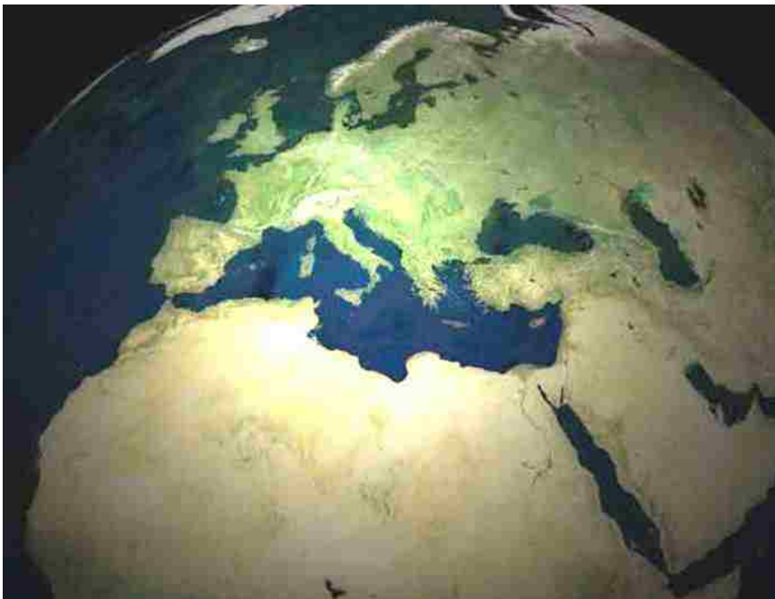
Figure 1 Mediterranean Basin

The scope of this research is the vast knowledge connected to developing a biblical atlas, as well as the entire geography of the Bible. The proposed study area is the east end of the Mediterranean Basin i.e. Historical Palestine. However in other instances, the study area may be extended to cover any areas encountered in biblical texts. Although the focus of this thesis will concern how a biblical atlas is built, it will also consider which maps might be included and which topics might be considered. Below is a satellite image of Europe, the Middle East, and Northern Africa. This area is part of the geography included in the Bible (Figure 1).