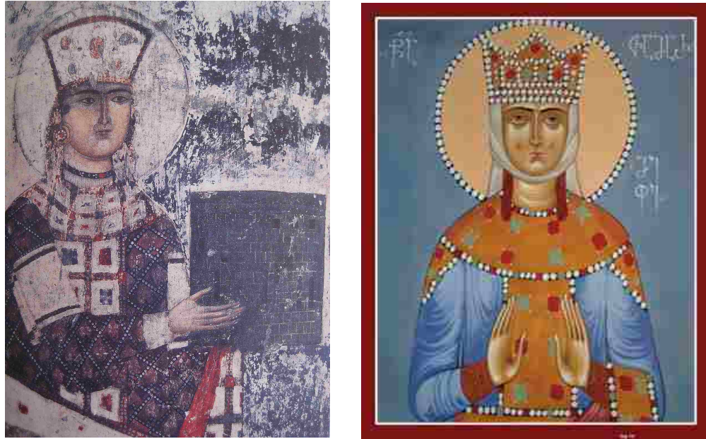
Figure 4.3: Georgian depictions of Queen Tamar.