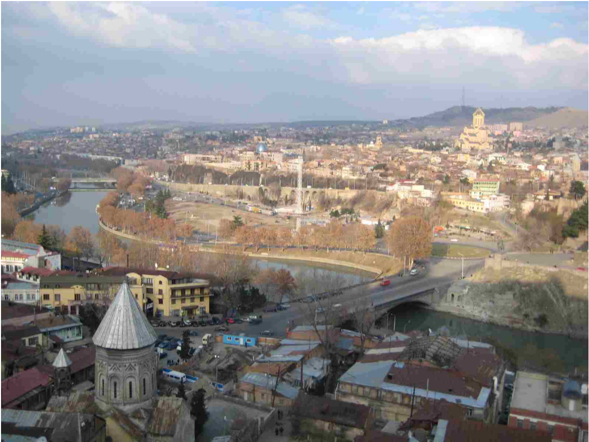
Figure 3.2: Old Tbilisi district along the Mtkvari River