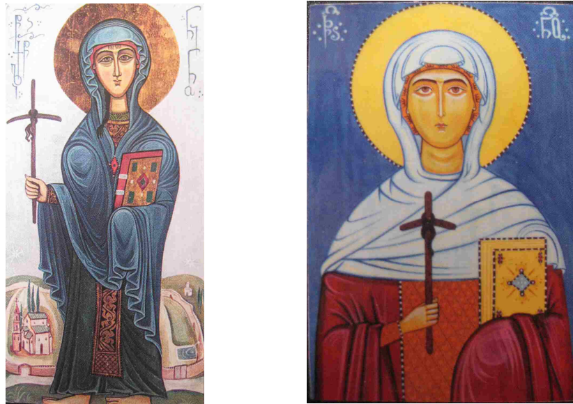
Figure 4.1: Georgian iconography of Saint Nino

depicts Nino as a simple slave girl from Jerusalem who prayed to God to save a village women's sick child. As word spread of this girl's miracle, Queen Nana of Iberia requested the audience of Nino to cure her illness. When the Queen was cured, she baptized herself Christian, with the country of Iberia and her King Mirian to follow.