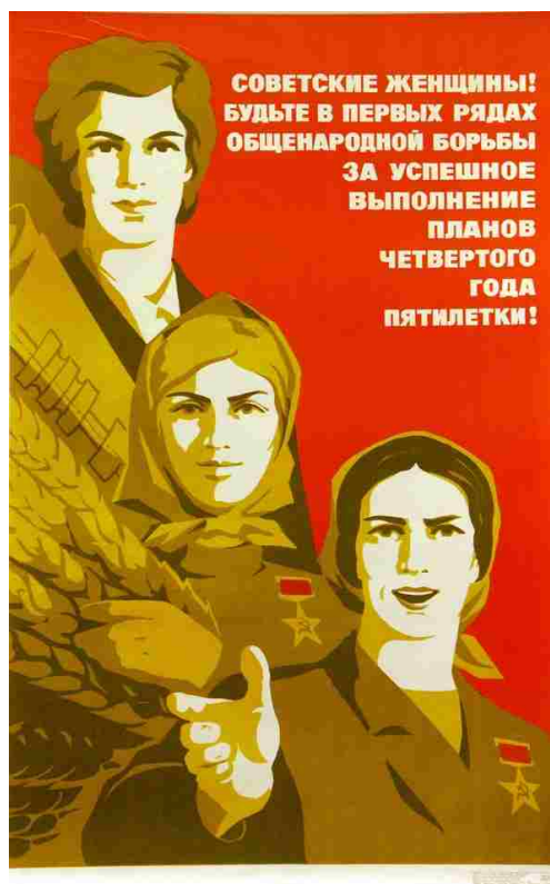
Figure 4.6: Soviet propaganda poster, 1974: “Soviet Women! Be the first in line for the national struggle to successfully fulfill the Five-Year Plan in four years!”

It was also during this time, that the Bolsheviks attempted to upgrade the status of women by changing, in the Soviet mind, the oppressive traditional gender roles by asserting the invaluable nature of women’s work in building the new economy and in providing future workers. Throughout the socioeconomic transformation of Georgia under Stalin, women were requested to join in with the “building of socialism”(Figure 4.6); however, it was mostly because the economy needed cheap labor (Šiklová 1999). The number of workers in the economy had tripled in the Stalin years, “numbering over 600,000 in the early 1950, [of which] women made up forty percent of that number, a rise of fifteen percent since 1933” (Suny 1994, 280). While Soviet modernization initiated the means for women to enter the labor force, “the emancipation of women under the