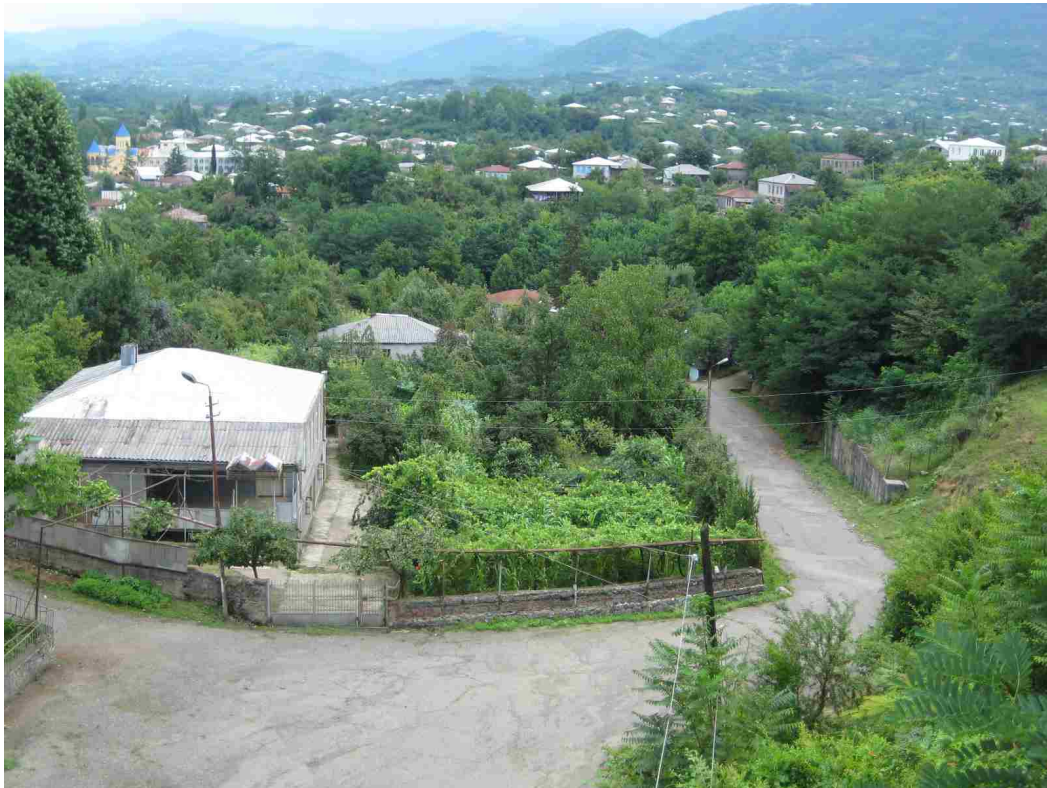
Figure 5.1: Village home with garden, Vani, western Georgia.

The physical placement of homes on the same horizontal plane, as in rural communities, fosters daily face-to-face interactions that create closeness even with unacquainted people. This horizontal dimension to the rural landscape is more conducive to close interpersonal relations between family, friends, and neighbors that are the