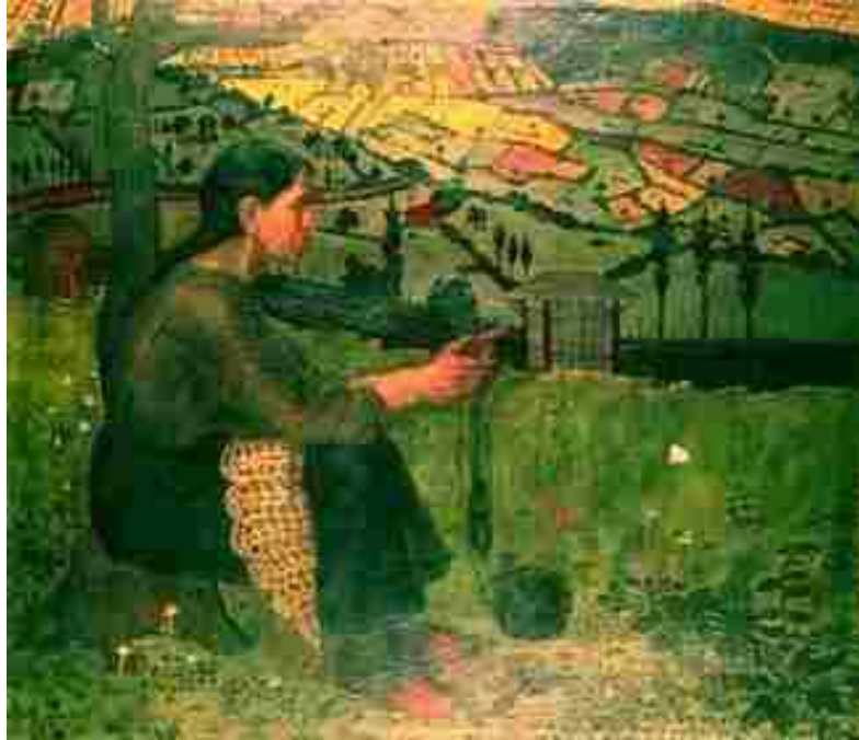
Figure 4.4: Imereti — My Mother, David Kakabadze, 1918.

The importance of the mother for Georgian families and the extent to which motherhood plays a role in migrant women's lives is critical to this research. One of Georgia's most beloved poets Ilia Chavchavadze (1858) describes a mother's role during the trying times under the Russian empire in his poem To a Georgian Mother :