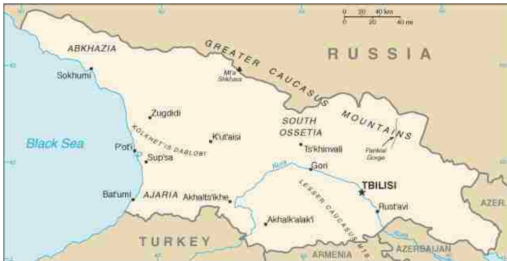
Figure 1.1: The Country of Georgia (Source: CIA Factbook 2007).

Society in Georgia sees women as the ones who raise the children, take care of the household, and preserve the traditional spirit of the family. Throughout history, family for a woman has been a key agent in ensuring her personal happiness and welfare, and as a social asset, which influences her social positions and allows her to view herself as socially valuable. Women's lives have been strained since the dissolution of the Soviet Union and Georgian independence in 1991. Standards of living took a sharp downturn after the collapse of the Soviet economy, when jobs formerly guaranteed by the state simply ceased to exist. As processing industries closed down and export markets for Georgia's products collapsed, poverty increased in both urban and rural areas (Figure 1.1). This downfall in the economy and stagnation in employment opportunities increased the burdens on women, as the ones who maintain the household and care for their family's needs.