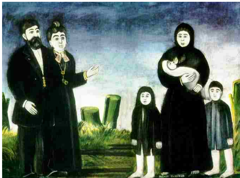
Figure 4.5: Childless Millionaire and Poor Woman Blessed with Children, Niko Pirosmiani, 1909.

freedom to enrich Georgian lands. The role of the mother is to raise families, and more specifically, sons who are pious and faithful to their nation whether it is to revolt against the Russian empire, to become a strong member of Soviet society, or to become educated and attain a successful career. This role makes women the keepers of religion and nation, as they produce the future generations. Motherhood is extremely important to all Georgians, not just Georgian women. Motherhood is a goal and mothers are revered. Niko Pirosmiani's 1909 painting, Childless Millionaire and Poor Woman Blessed with Children , exemplifies that wealth, especially for women, is measured in her capacity to reproduce society (Figure 4.5).