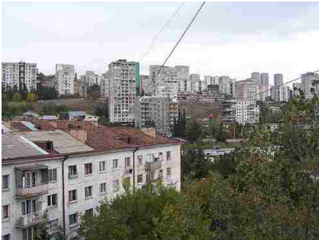
Figure 5.2: Soviet apartment blocks in Tbilisi, Saburtalo district.

On the other hand, the vertical nature of high-rise buildings in urban society separates one from her neighbors, which can cause her to miss those crucial connections necessary to create a community. The high-rise apartments keep people isolated and compartmentalized to live their lives with little interaction, the antithesis of Georgian society.