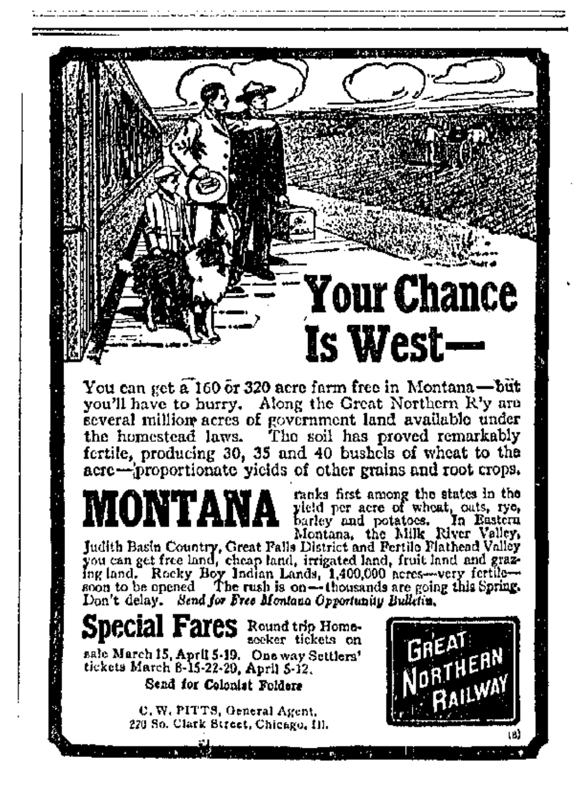
Figure 1: Great Northern Railroad advertisement (Great Northern Railroad 2010).