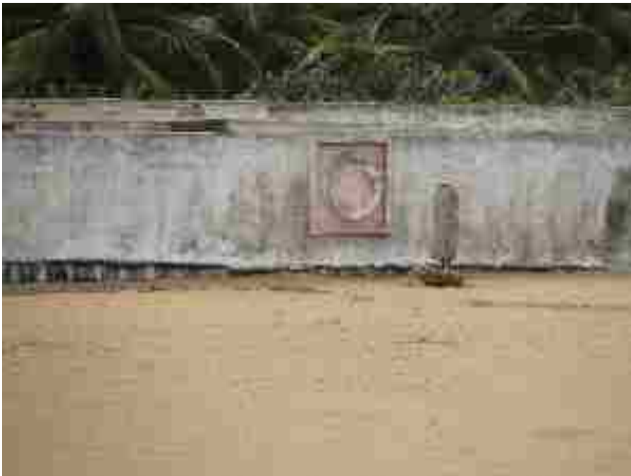
Figure 3. Monument Displaying the Arc En Ciel along the Rue des Esclaves