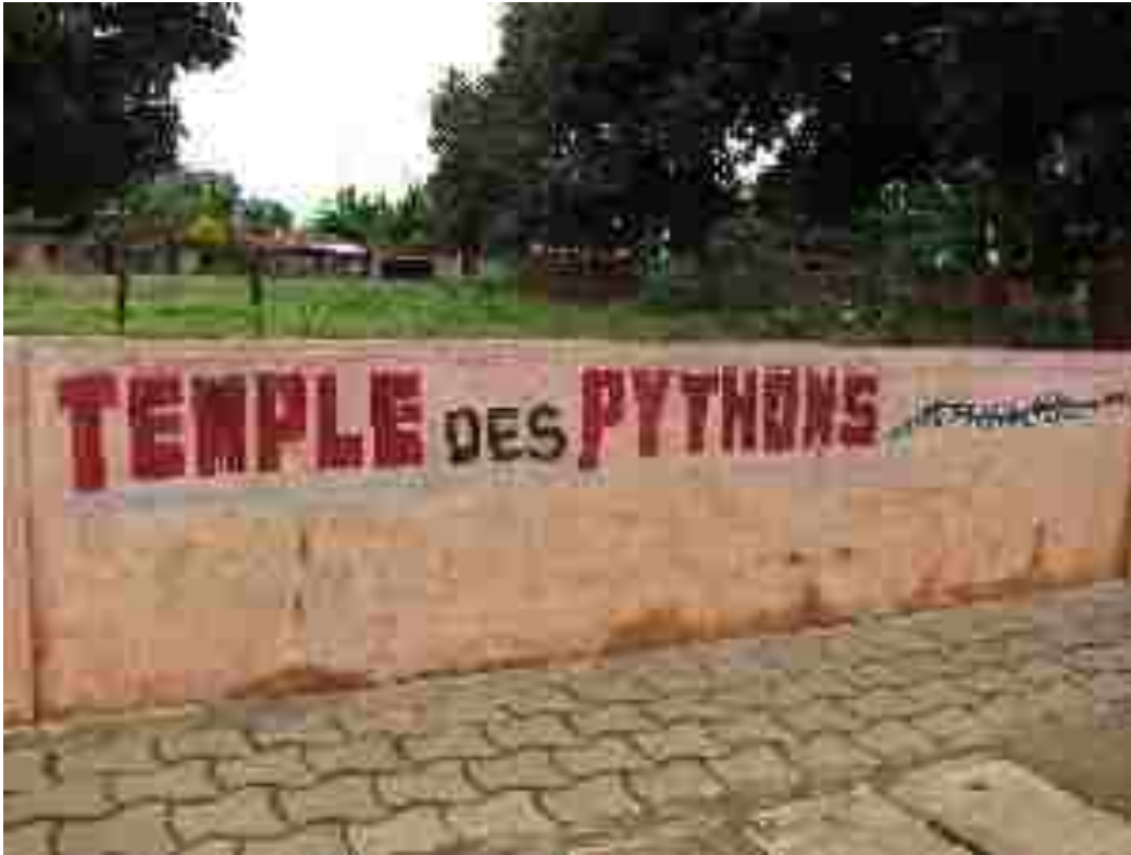
Figure 10. Temple of the Pythons entrance