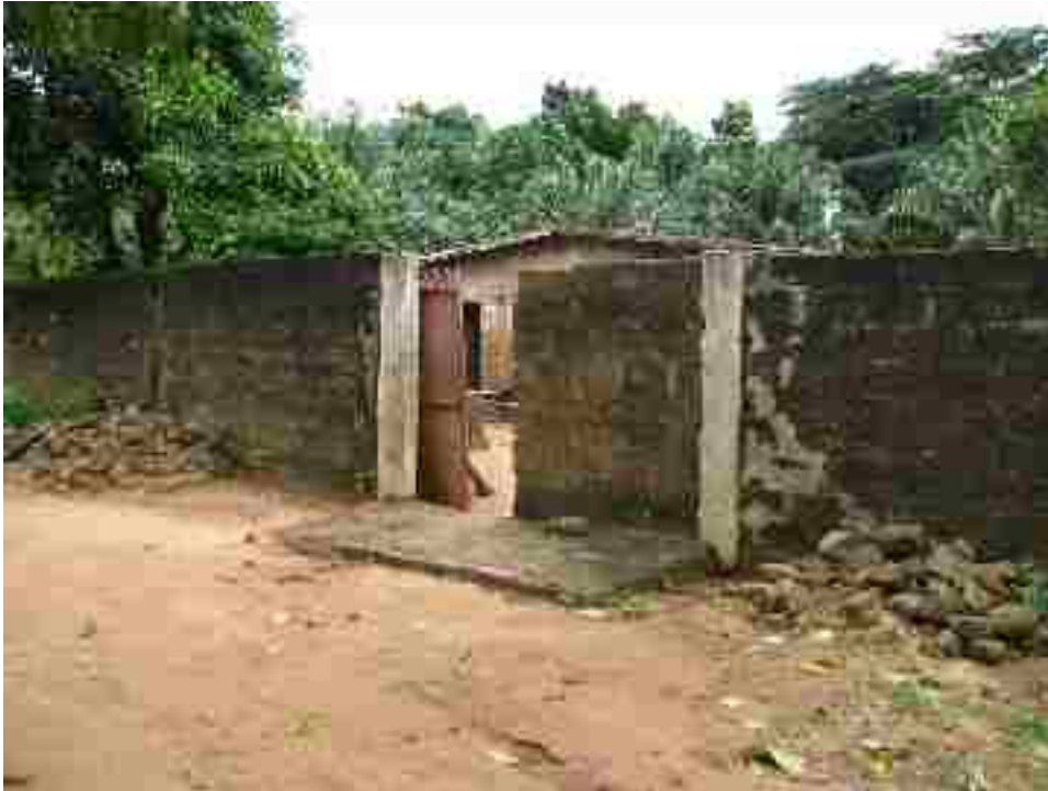
Figure 20. Household compound constructed on Forêt Sacrée de Kpassé land