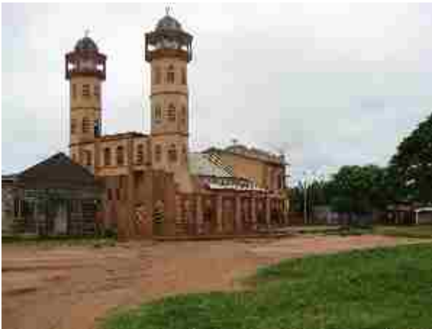
Figure 5. Ouidah's Grande Mosquée