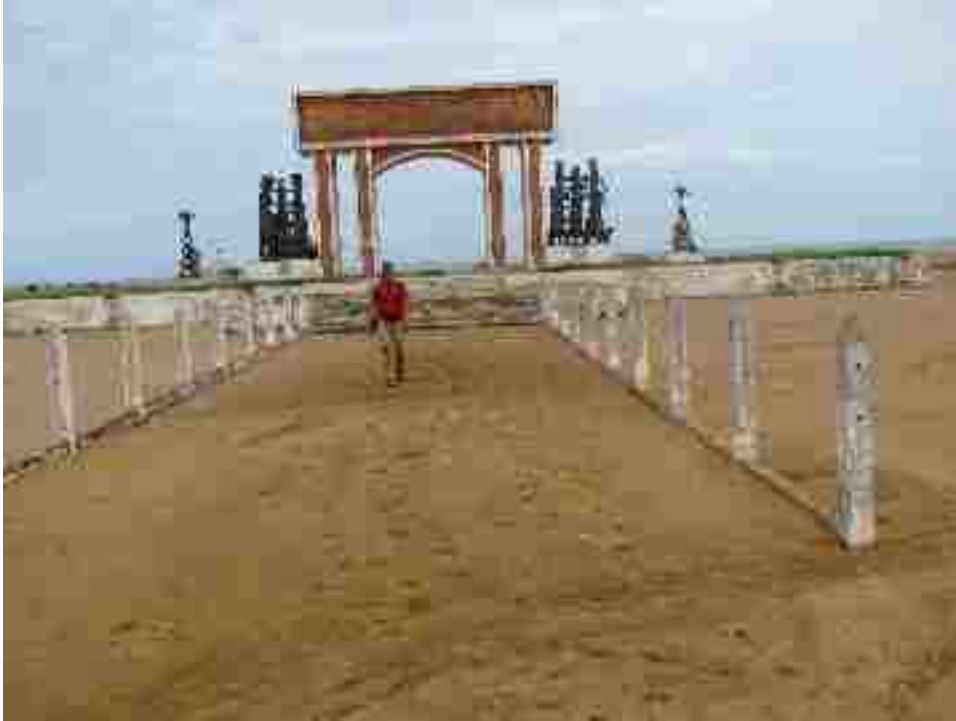
Figure 12. Author at the UNICEF beach site outside of Ouidah