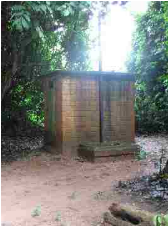
Figure 27. Toilet located in the Forêt Sacrée de Kpassé