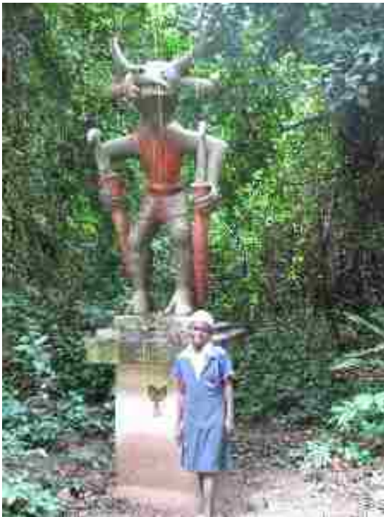
Figure 13. Young Vodunsi girl in front of male god of lightning, Hevioso , in the Forêt Sacrée de Kpassé