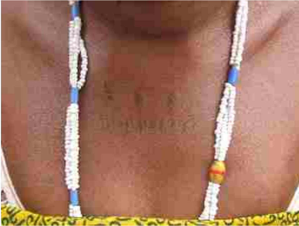
Figure 8. Scarification on female Vodunsi