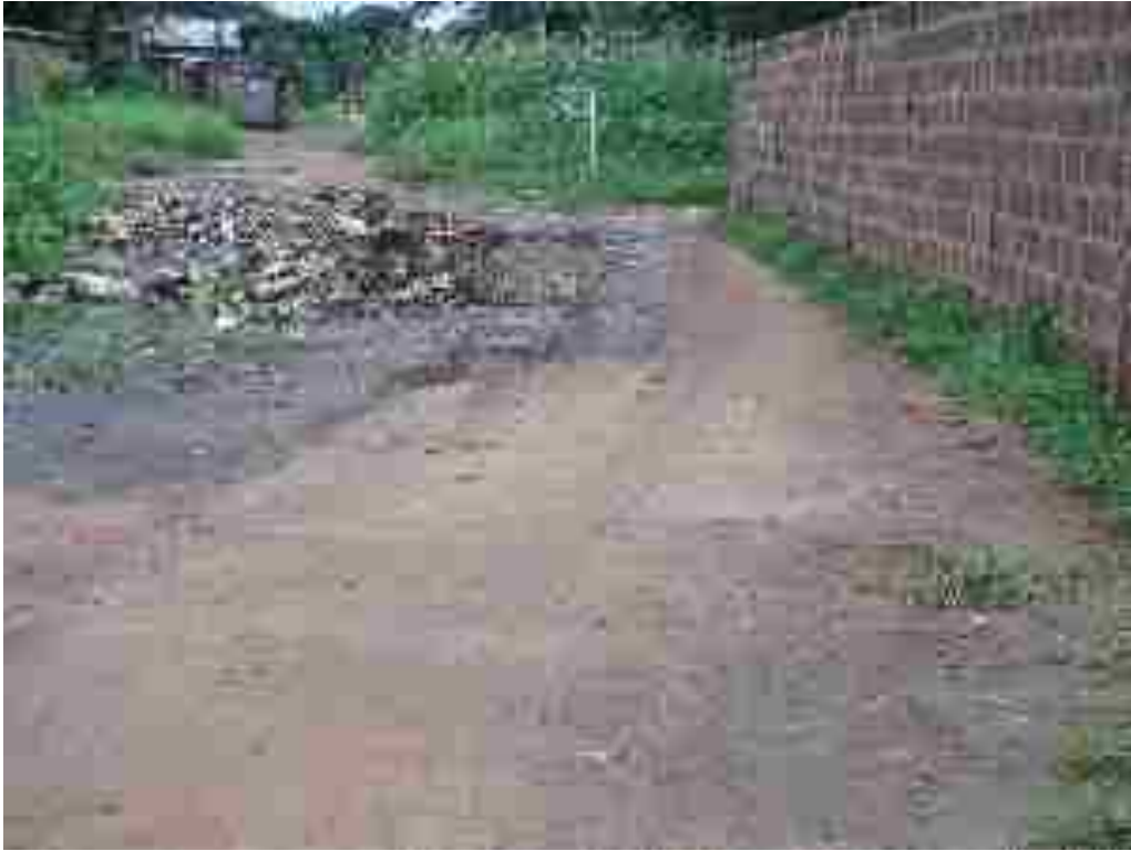
Figure 22. Rubbish pile immediately adjacent to Forêt Sacrée de Kpassé wall