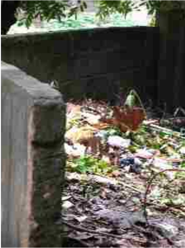
Figure 26. Rubbish behind the wall in Figure 24