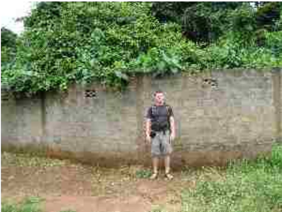
Figure 23. Author standing in front of the highest point of the Forêt Sacrée de Kpassé's protection wall