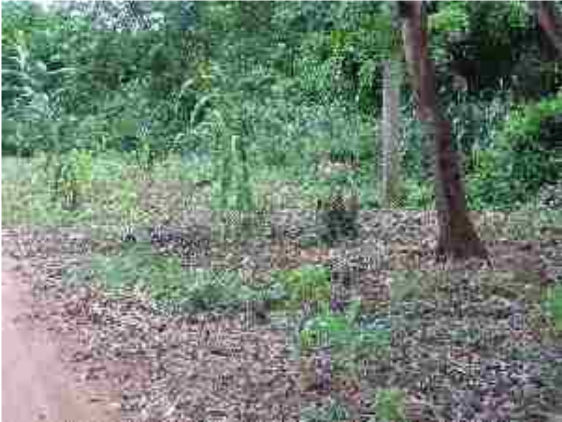
Figure 18. Maize cultivation where Forêt Sacrée de Kpassé land has been removed