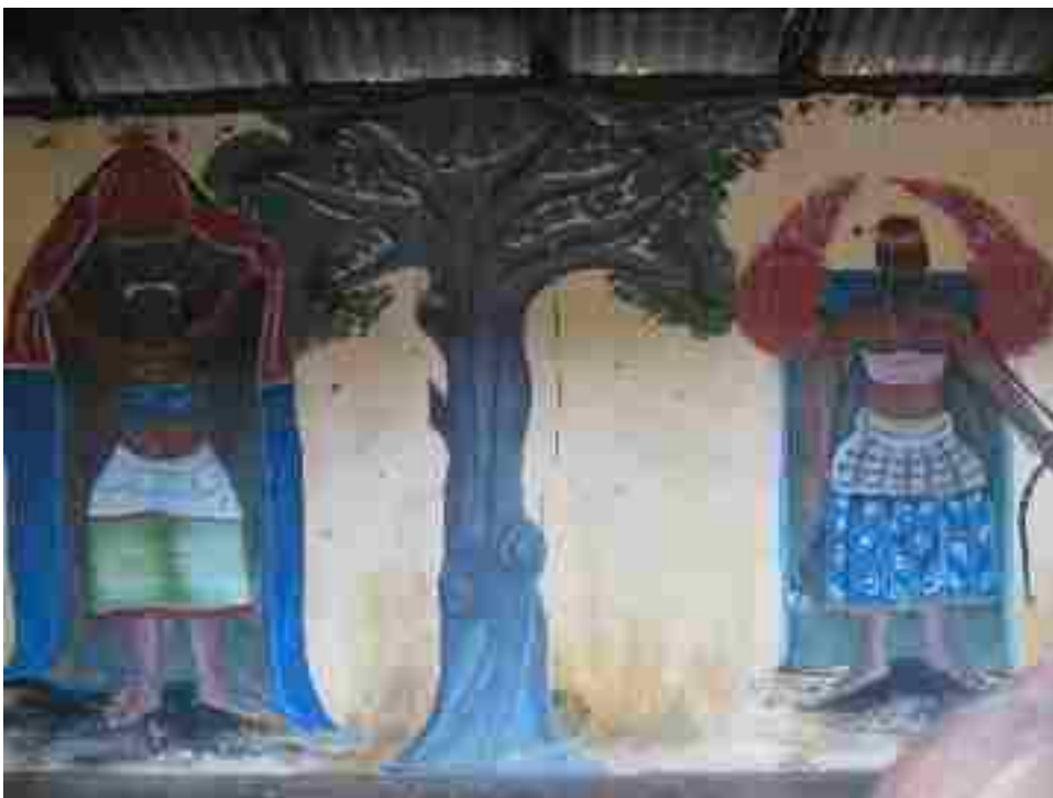
Figure 17. Mural of Bokonon painted on Vodunsi home in Ouidah