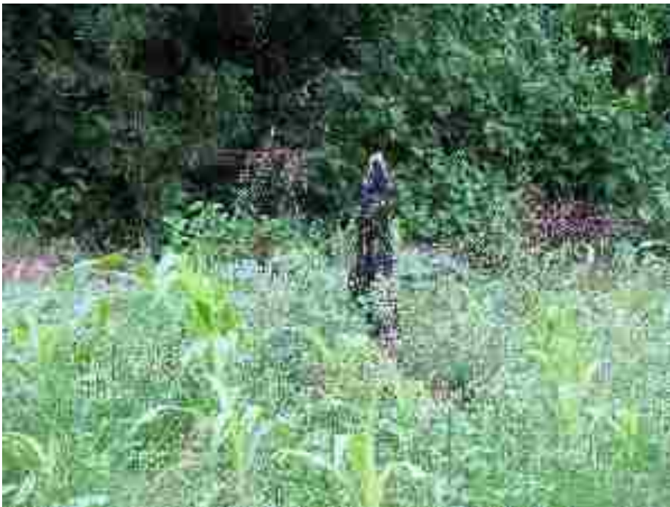
Figure 19. Bokonon property marker in the middle of maize crop in Figure 18