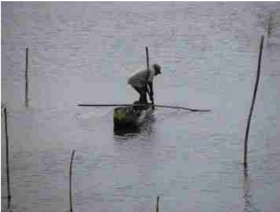
Figure 15. Man using Pirogue to harvest fish in the estuary outside of Ouidah