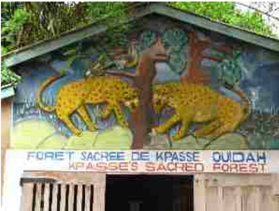
Figure 11. Forêt Sacrée de Kpassé entrance