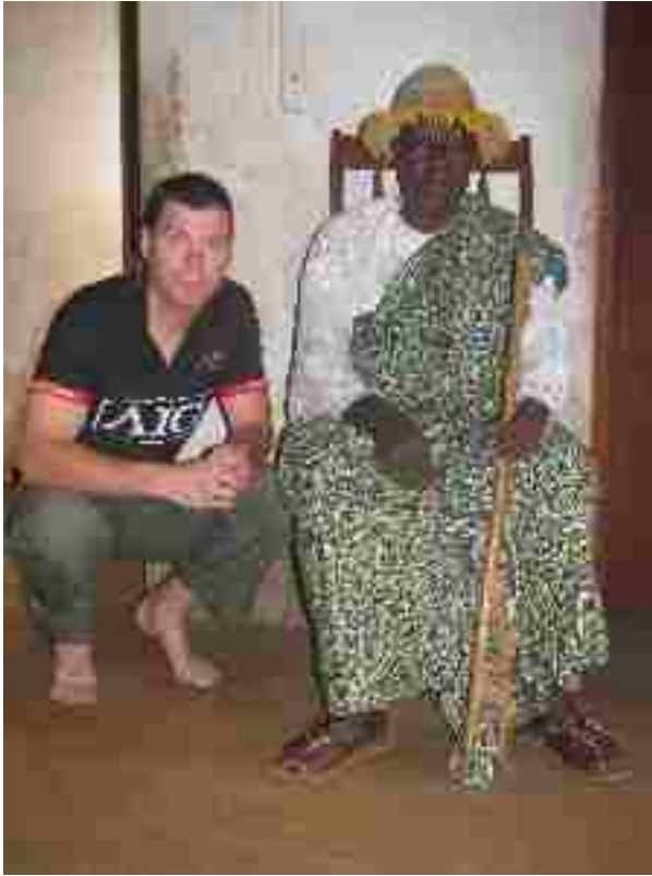
Figure 14. Author with Kpassenon