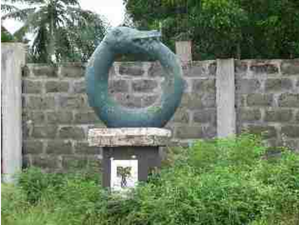
Figure 4. Monument along the Rue des Esclaves depicting the Arc En Ciel