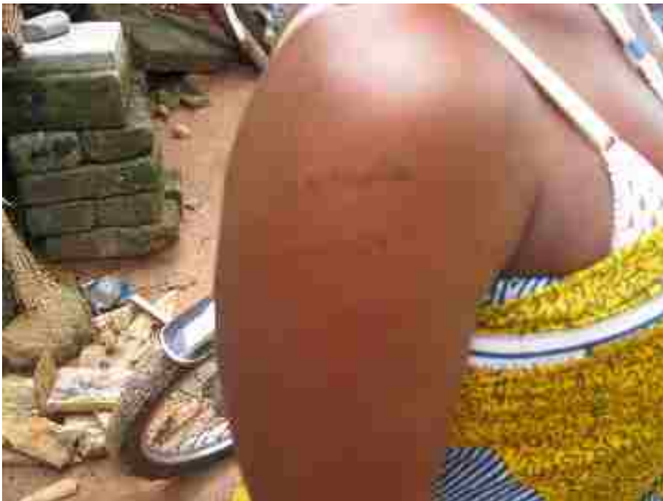
Figure 7. Scarification on Vodunsi interviewee