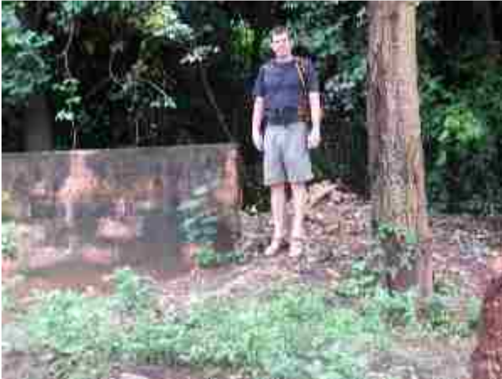
Figure 24. Author adjacent to the lowest existing point of the Forêt Sacrée de Kpassé's protecting wall