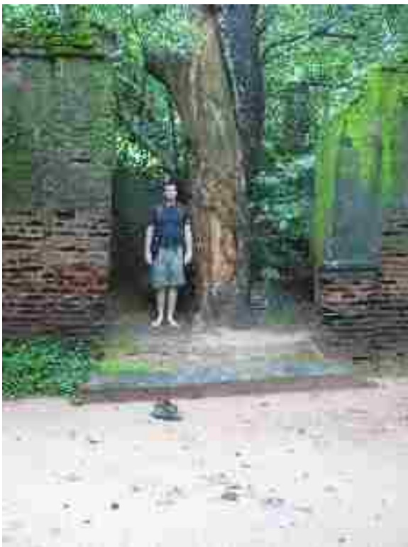
Figure 25. Author next to the central focus of the Forêt Sacrée de Kpassé , the Loko tree into which King Kpassé was said to have transformed in 1661