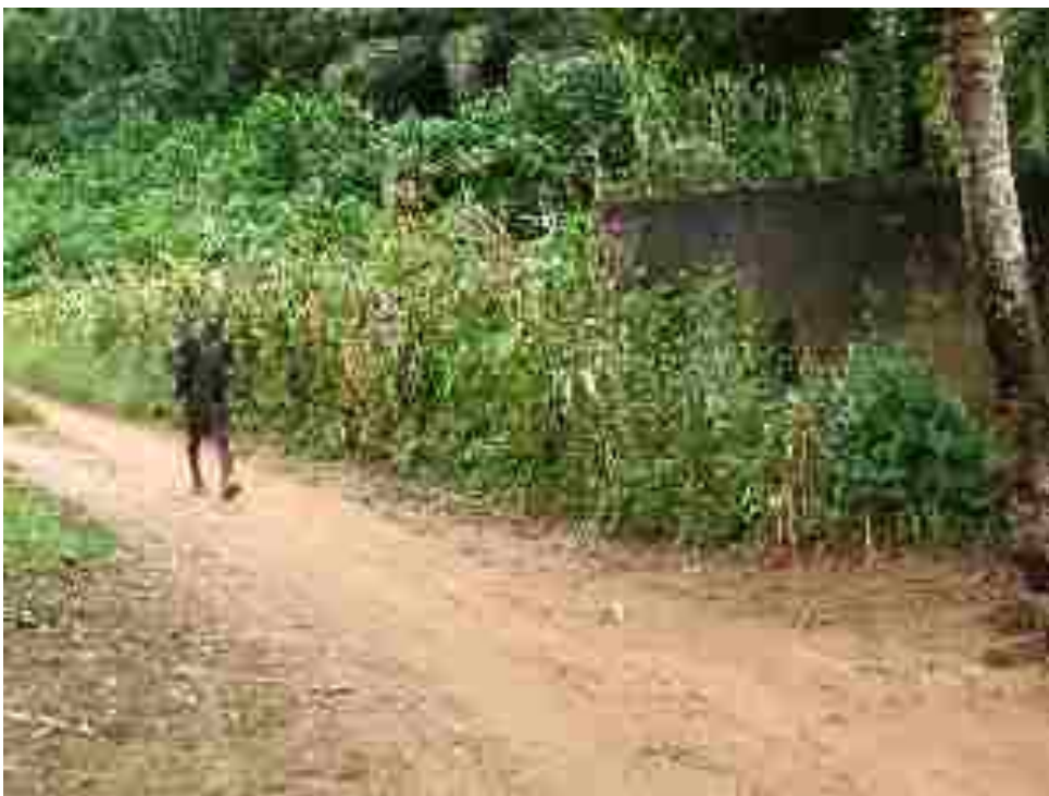
Figure 21. Maize cultivation by tenants of compound in Figure 20, also within Forêt Sacrée de Kpassé land