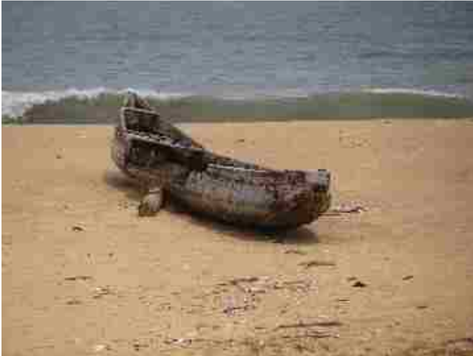
Figure 2. Ocean Pirogue used off the coast of Ouidah