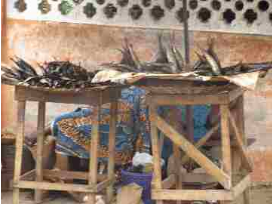
Figure 16. Dried fish for sale along the roadside in Ouidah