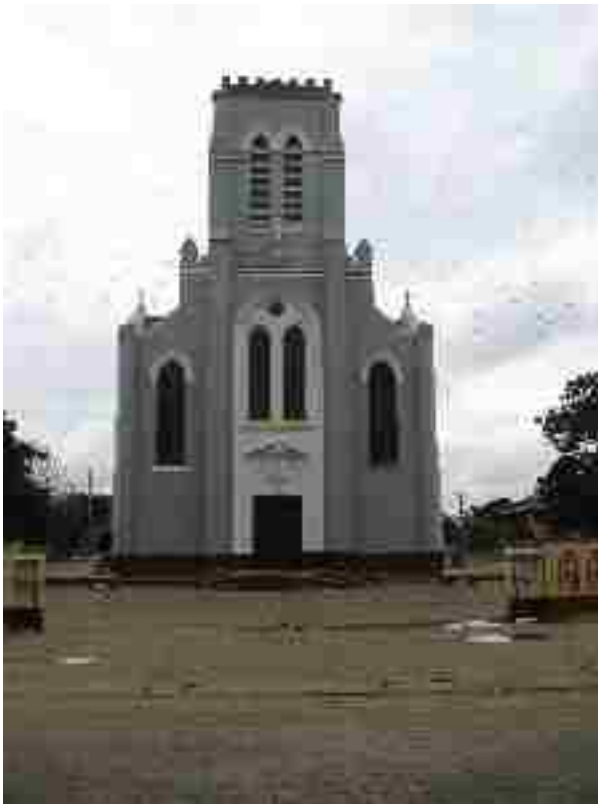
Figure 9. Basilique Immaculée Conception