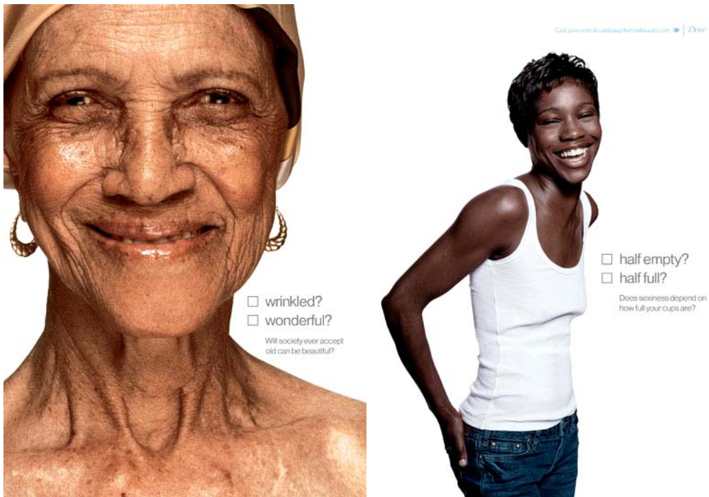
Image 16: Examples of the ad campaign for Dove for real beauty that challenges society's conception of beauty. A similar challenge can be applied to society's conception of sex. 32