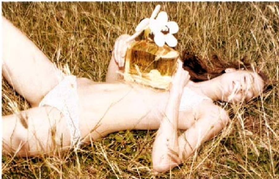
Image 4: This is an ad for Marc Jacob’s fragrance “Daisy.” The objectification present is an almost nude model lying in a field of grasses and weeds holding a huge bottle of perfume. None of the elements of this ad are related to one another. The model is as much an object as the bottle of perfume. 9

but she is equally displayed as a sex object” (Merskin, 2006, 207). 8 When a female views such an ad she is receiving the message that she is not a complete being, but rather only valued for certain aspects of her body. Disconnection begins here, but it could turn into alienation if the female is repulsed by her own body in comparison to the body depicted in the ad. Due to the nature of the ad the female will look at her own breasts, stomach, buttocks, etc. independently as an object. She will not see her body as a whole and therefore will not see how her breasts, stomach or buttocks look in relation to her whole body, her whole being and her whole self.