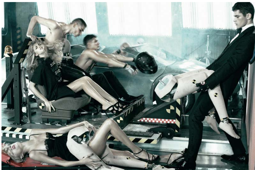
Image 9: This is the final photo of the series for Dsquared's 2008 spring ad campaign. What is particularly disturbing in this image is the sexual acts occurring with parts of the test dummies. 14