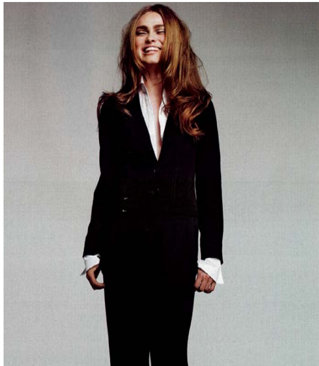
Image 13: This is an ad for Strenesse clothing line. Notice how the model is laughing. She looks natural and at ease. Rather than a cold, lifeless stare we are gazing upon a real person caught in a moment we can all relate to. 28

possibly directs, what happens. In such ads we see a pause or a moment of the disturbing events that are unfolding. In contrast, erotica would present a complete representation of sex or sexuality. It would not be a moment of violence, but rather concept of sexuality, equality, acceptance and celebration.