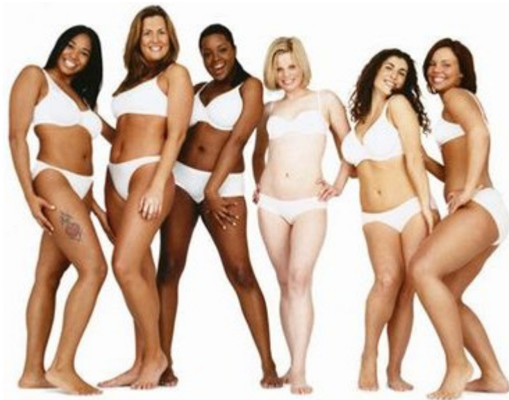
Image 15: This is an example of Dove’s “Campaign for Real Beauty.” The women represent the average woman. They have breasts, thighs, stomach, etc. of varying size. Each one is unique and sexy in her own way. 30

they are closely linked conceptions in our society. In fact, it seems that when one says someone is beautiful they are also saying the person is sexy or vice versa. The goal of the campaign is “to change the status quo and offer in its place a broader, healthier, more democratic view of beauty. A view of beauty that all women can own and enjoy everyday” (Dove website, 2008).