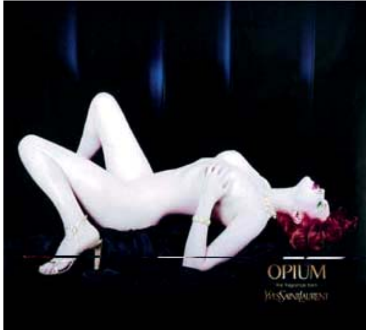
Image 7: This is the Yves St. Laurent ad described below and is an example of submission found in advertising. It is very similar to Image 12 in that both models are in the midst of an orgasm and both are unaware of being watched by the viewer. 12