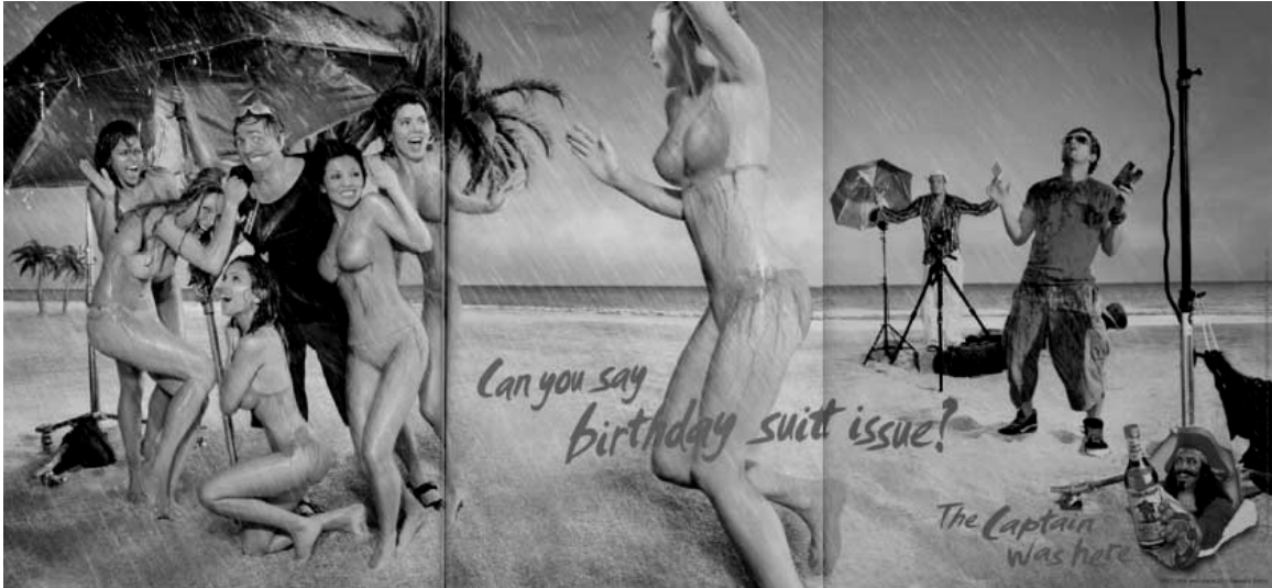
Image 11: This ad illustrates the male loser approach in advertising. 16

This ad sends a couple of concerning messages. First and foremost it is telling the male viewers that they are, in effect, the two men in the ad who are celebrating their good fortune of seeing the women models nude, or almost nude, because neither these men nor the male viewers would ever see such beautiful women nude in reality. What is disturbing about this ad is that the women are being tricked into nudity. Basically, the male sexual loser cannot view women like these because they are losers and no beautiful woman would willingly show herself to a loser. Thus revenge is used.