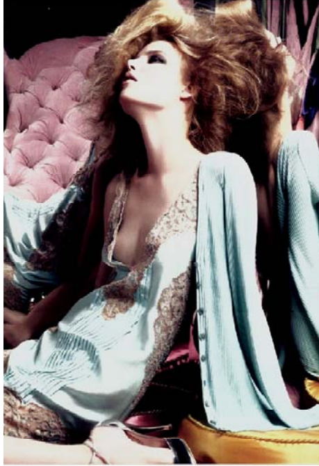
Image 10: Another common violent pornographic depiction is portraying the model as dead. 15

The challenge to female sexuality and experience is further propagated through the representation of men as aggressive and challenging sexual fantasies. These ads typically have a man staring right into the camera challenging the viewer to look away or dare them to keep looking. “Many models stare coldly at the viewer, defying the observer to view them in any way other than how they have chosen to present themselves: as powerful, armored, emotionally impenetrable” (Bordo, 1999, 186). This starring of the model is often a portrayal of male dominance (Bordo, 1999, 187). When his gaze is challenging it takes his objectification away because he is defining how the viewer will see him. He is no longer a sex object but rather an aggressive, assertive male. This is an element of sexuality that is denied to women in magazine advertisements and possibly society itself. If a woman has an assertive, challenging gaze it still does not eliminate her