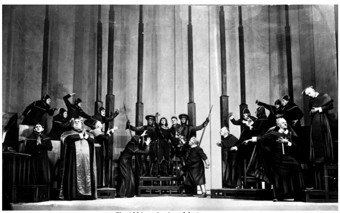
The 1924 production of St. Joan