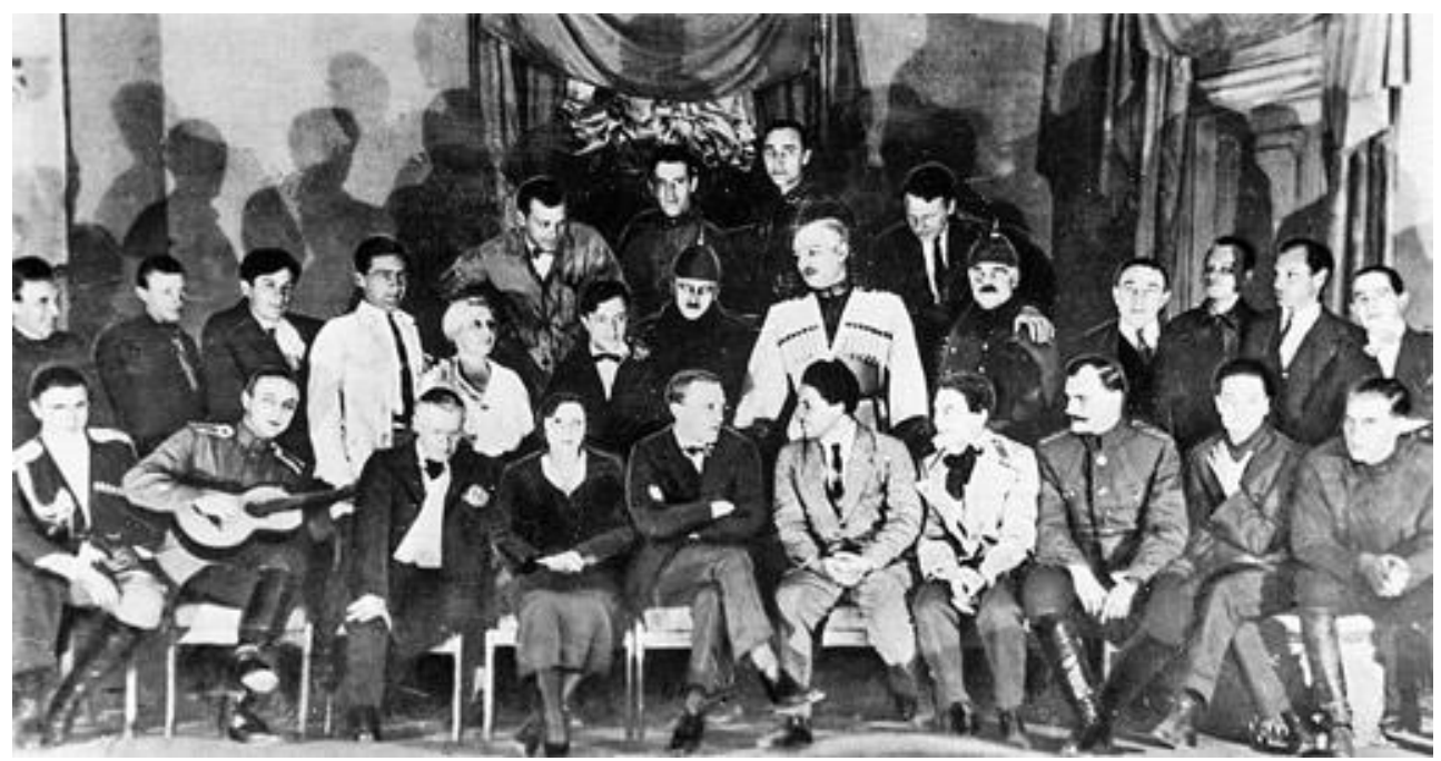
Mikhail Bulgakov (arms folded) and the company from <u>Days of the Turbins</u>