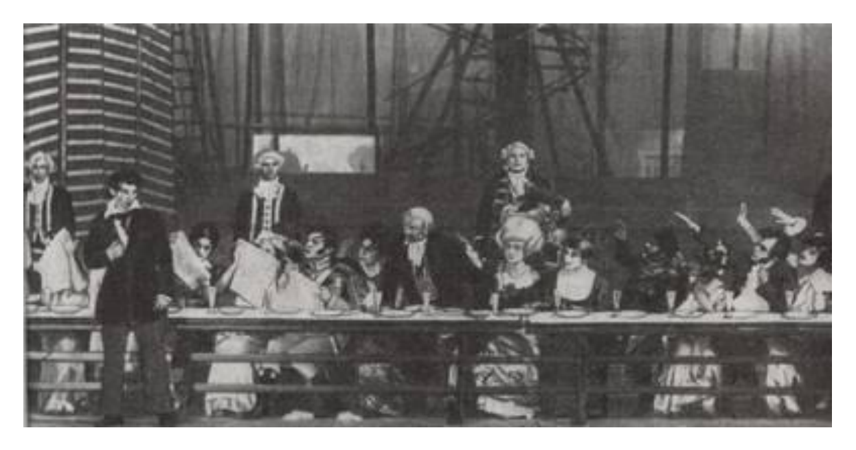
Clockwise from top left: Aleksandr Griboedov; Meierkho'ld, Maiakovskii & Shostakovich; Lunacharskii ca. 1928; Chatskii is presumed mad and ostricized during the banquet scene from Meierkhol'd's production of <u>Woe to Wit</u>