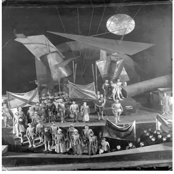
The 1920 production of The Dawns