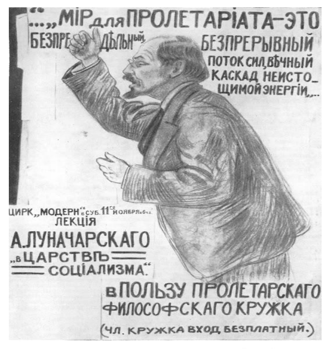
ПЛАКАТ — ОБЪЯВЛЕНИЕ О ЛЕКЦИИ ЛУНАЧАРСКОГО «В ЦАРСТВЕ СОЦИАЛИЗМА»