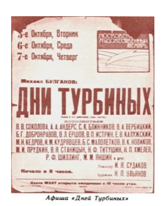
Poster for premiere of <u>Days</u>