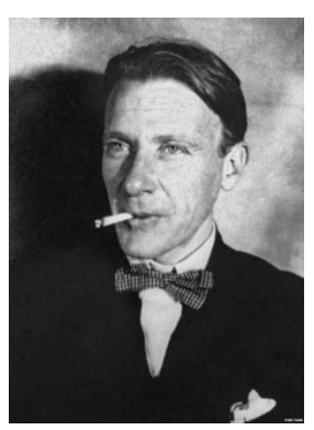
Bulgakov, ca. 1926