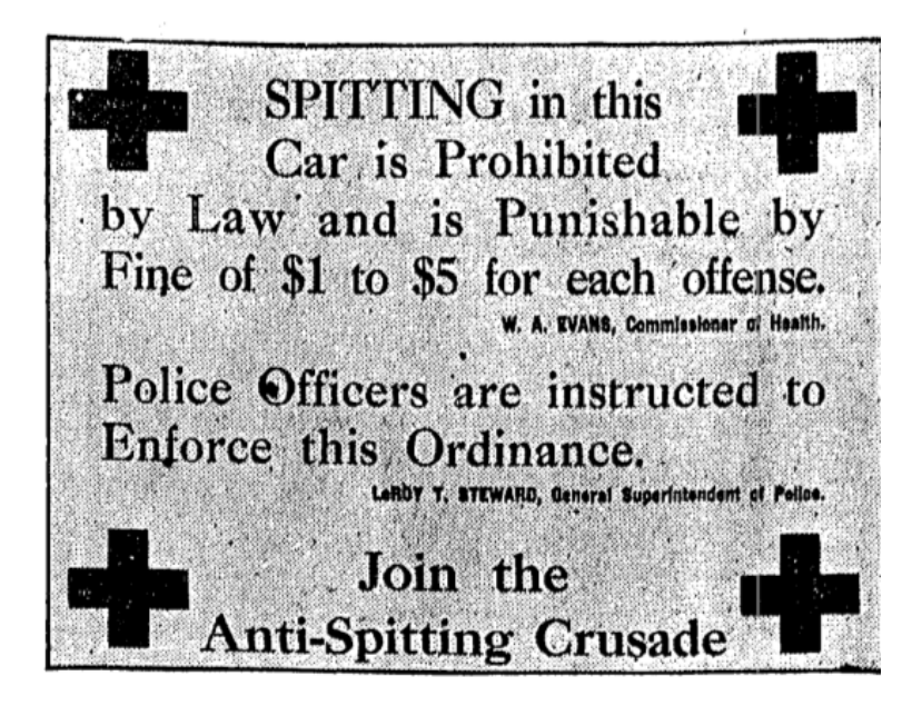
Fig. 1. A placard similar to that designed by the Brooklyn Women's Health Protective Association. This sign was used in Chicago street cars in 1910 and designed by a coalition of municipal officials and leaders of local civic groups, such as the United Charities and the Chicago Tuberculosis Institute.<sup>16</sup>

and windows. While some members preferred "Do not spit in this car," it was a broader, and decidedly more severe phrase, "Spitting positively forbidden," that eventually carried the day. The choice signified both the WHPA's and the Brooklyn Department of Health's goal of challenging as many spitters as possible. By choosing plain and straightforward language, they hoped no person would fail to understand that goal.<sup>15</sup>