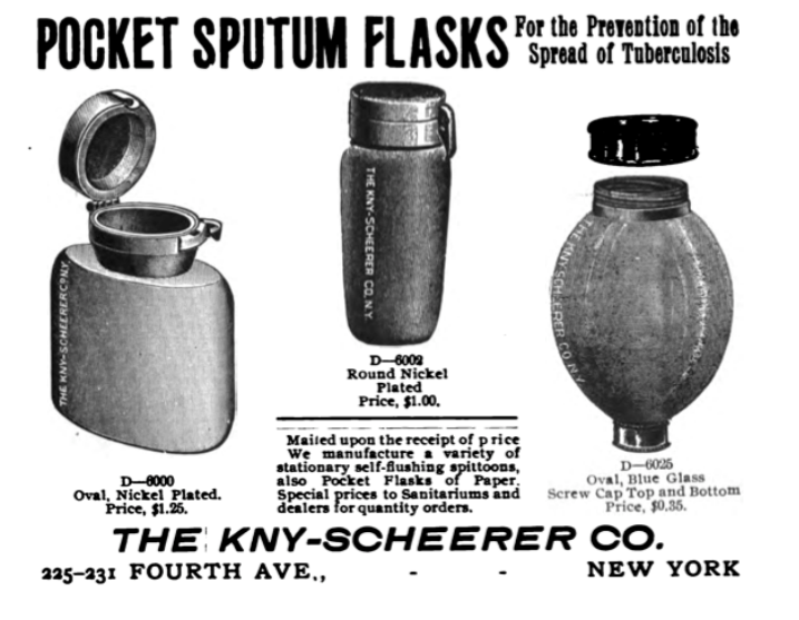
Figure 3. New York's Kny-Scheerer Co. worked with Dr. Adolphus Knopf to design and market "sputum flasks" like these and marketed them in the Journal of the Outdoor Life, the official journal of the National Association for the Study and Prevention of Tuberculosis.

impeded sales.<sup>82</sup> Of course, even if Knopf's flasks flourished on the market, they could never entirely control the spread of tuberculosis. Those groups most affected by consumption – immigrants and the working-class – were both unlikely to invest in such an item and likely to be unaware of their infection, thereby not even recognizing the need for a pocket flask.