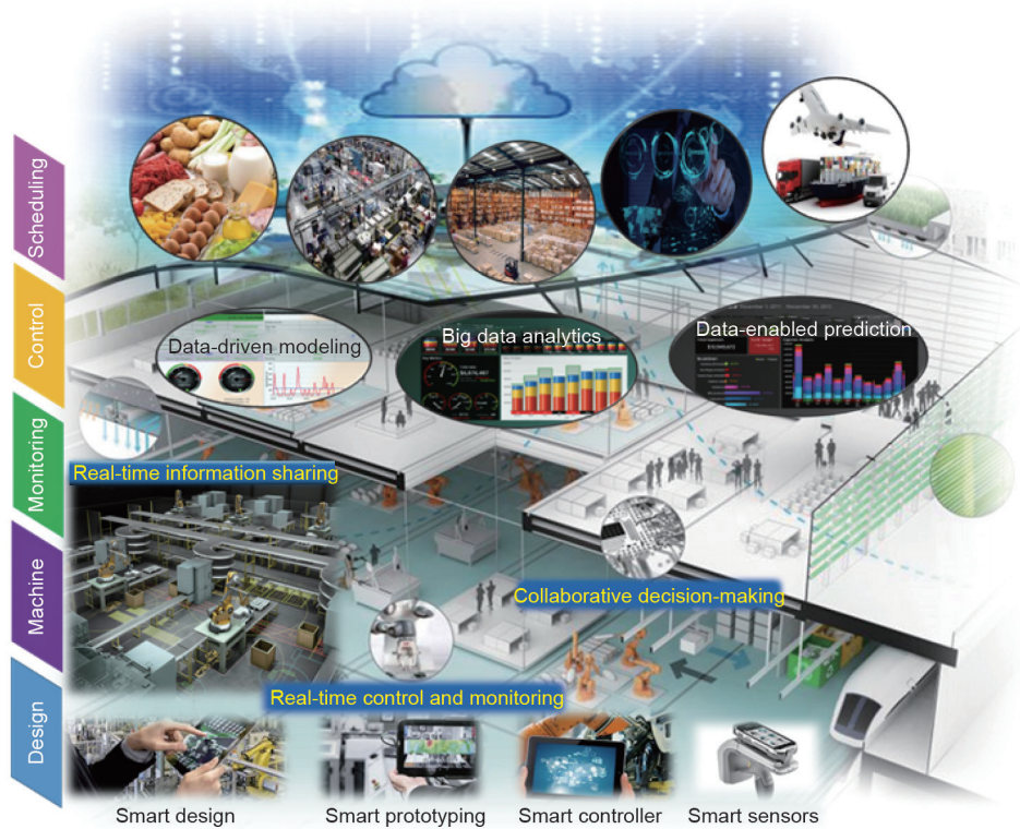
Fig. 2. A framework of the Industry 4.0 IMS.

distributed smart models using a hierarchical interactive architecture can be used.