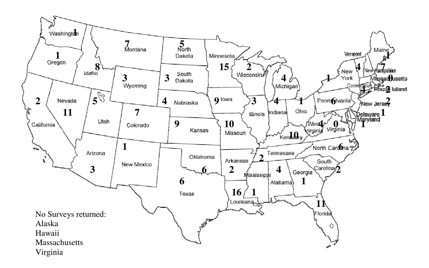
Figure 4.1. SURVEY RESPONSE by STATE

The survey process began with initial contacts in of May 2010. Every state had an equal opportunity to participate. Several principals responded saying they couldn't answer at that time (May) since they did not have current AYP information. In the summer months, many emails bounced back with out-of-office messages. Some principals did email a personal response. One from Hawaii explained that all surveys had to have pre-approval from their state superintendent's office. A Baltimore principal said that they also were not permitted to participate without written board approval.