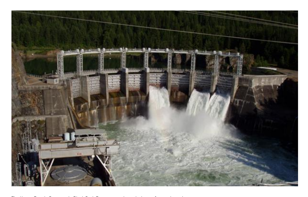
The Noxon Rapids Dam sends Clark Fork River water through three of its eight turbines.

So, the Noxon Rapids Dam rarely operates at peak capacity. Some argue that Avista shouldn't have rights to all that water, because most of the time, they do without it. But that's not how water law works.