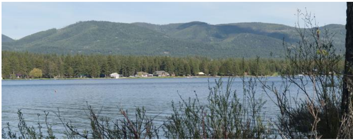
The community of Seeley Lake hugs the southern end of the lake.