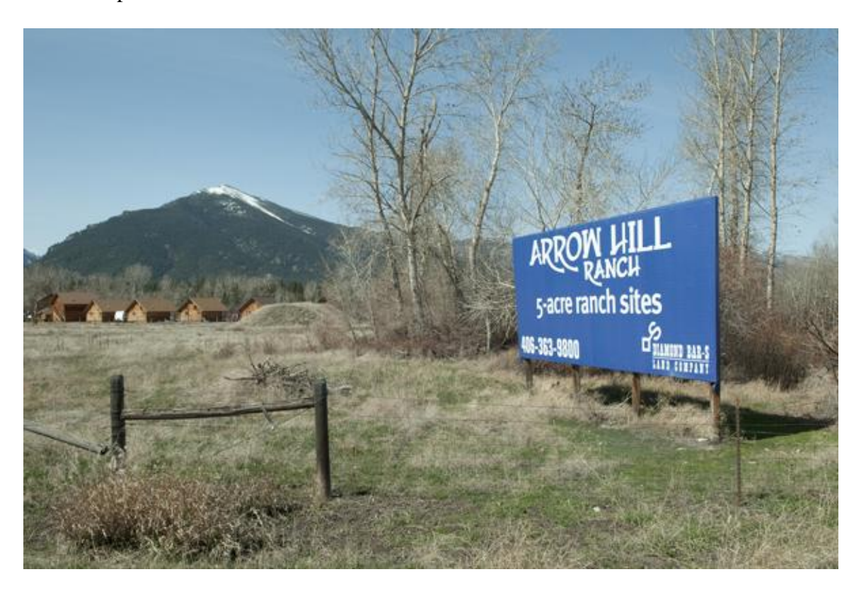
The selling of the Bitterroot Valley continues as land is bought and subdivided.

Without planning guidelines, Lavey couldn't do much to limit subdivisions. But the necessity of county planning is emerging as development continues, enabled by the small well exemption.