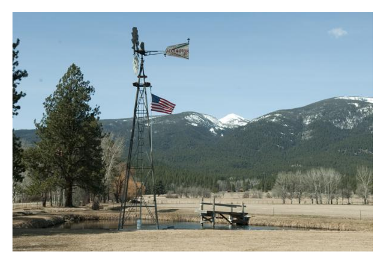
Windmills used to be the way to pump water on ranches in the Bitterroot Valley.

in the Bitterroot Valley, and others around the state, are starting to see wells as the new water thieves.