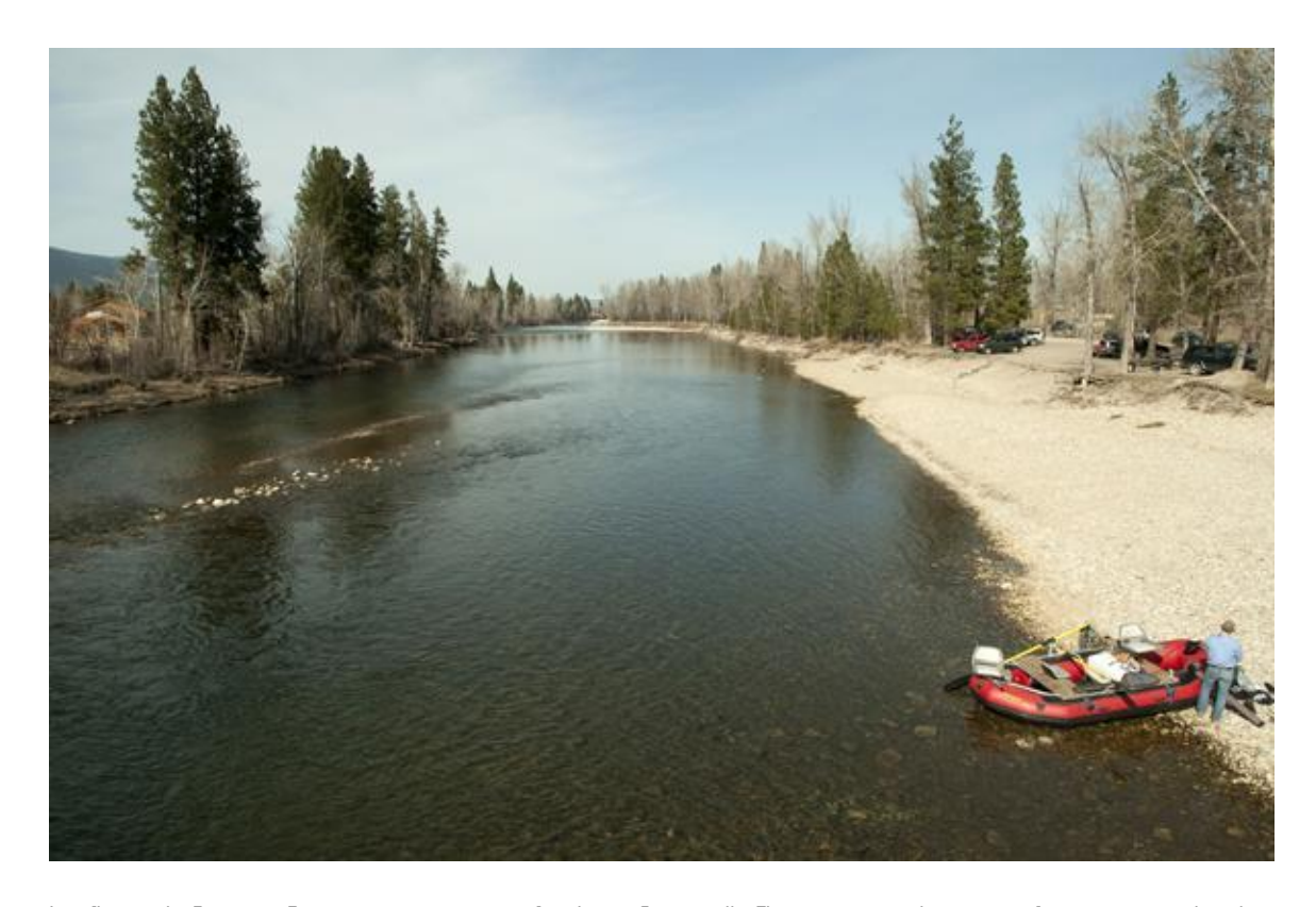
Low flow on the Bitterroot River exposes an expanse of rock near Stevensville. The river is not only a source of irrigation water but also a playground for fishermen, boaters and campers.

"As we continue to have dry winters and hot summers, it will get more attention."