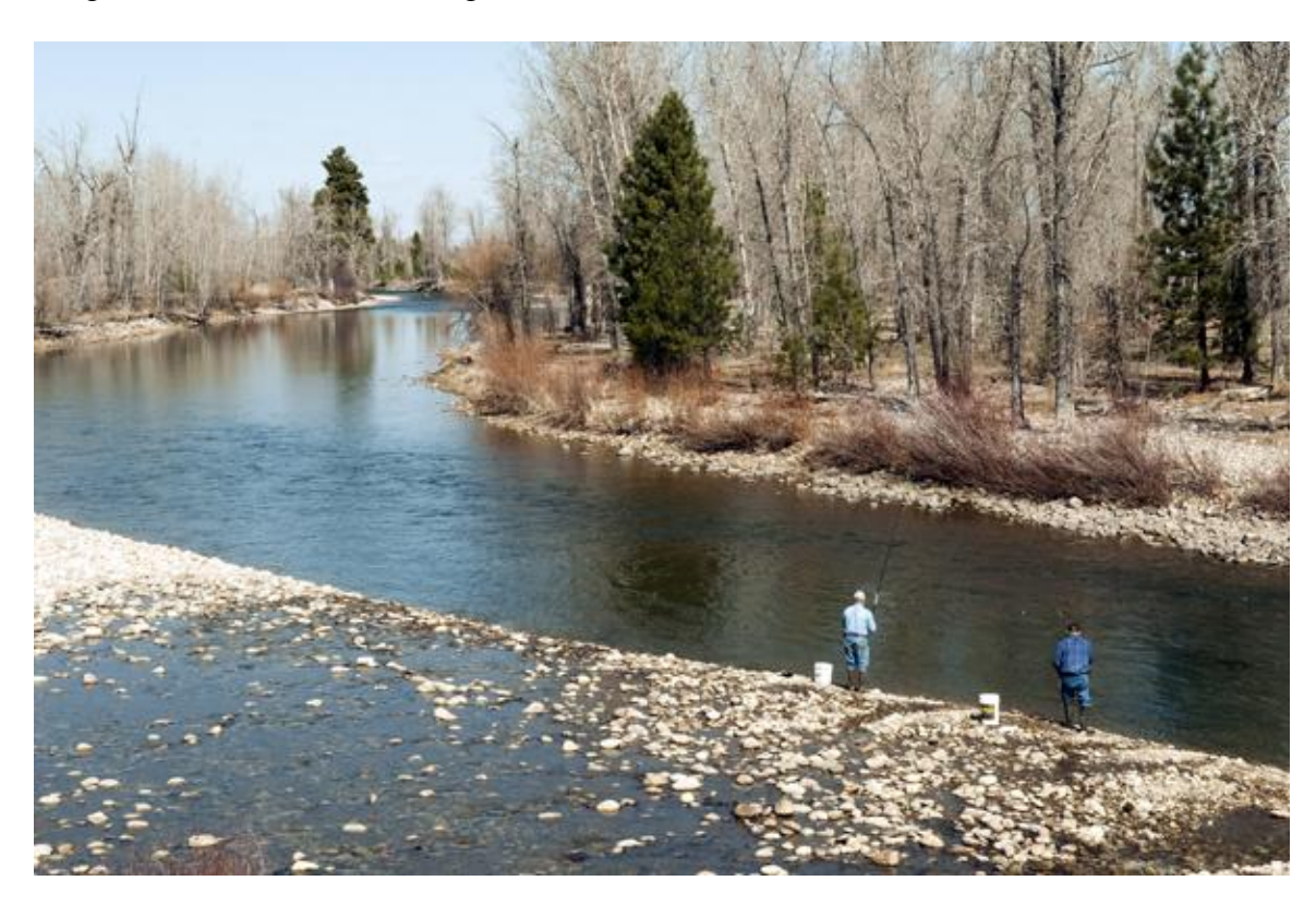
The Bitterroot River provides water for many uses, including irrigation and recreation.

The ruling acknowledged for the first time in Montana that taking water from below the ground is the same as taking it from above.