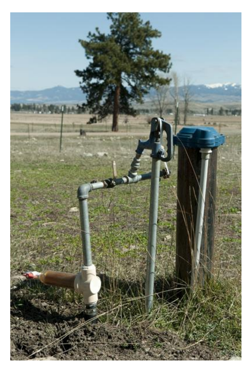
A new well awaits another house south of Hamilton.