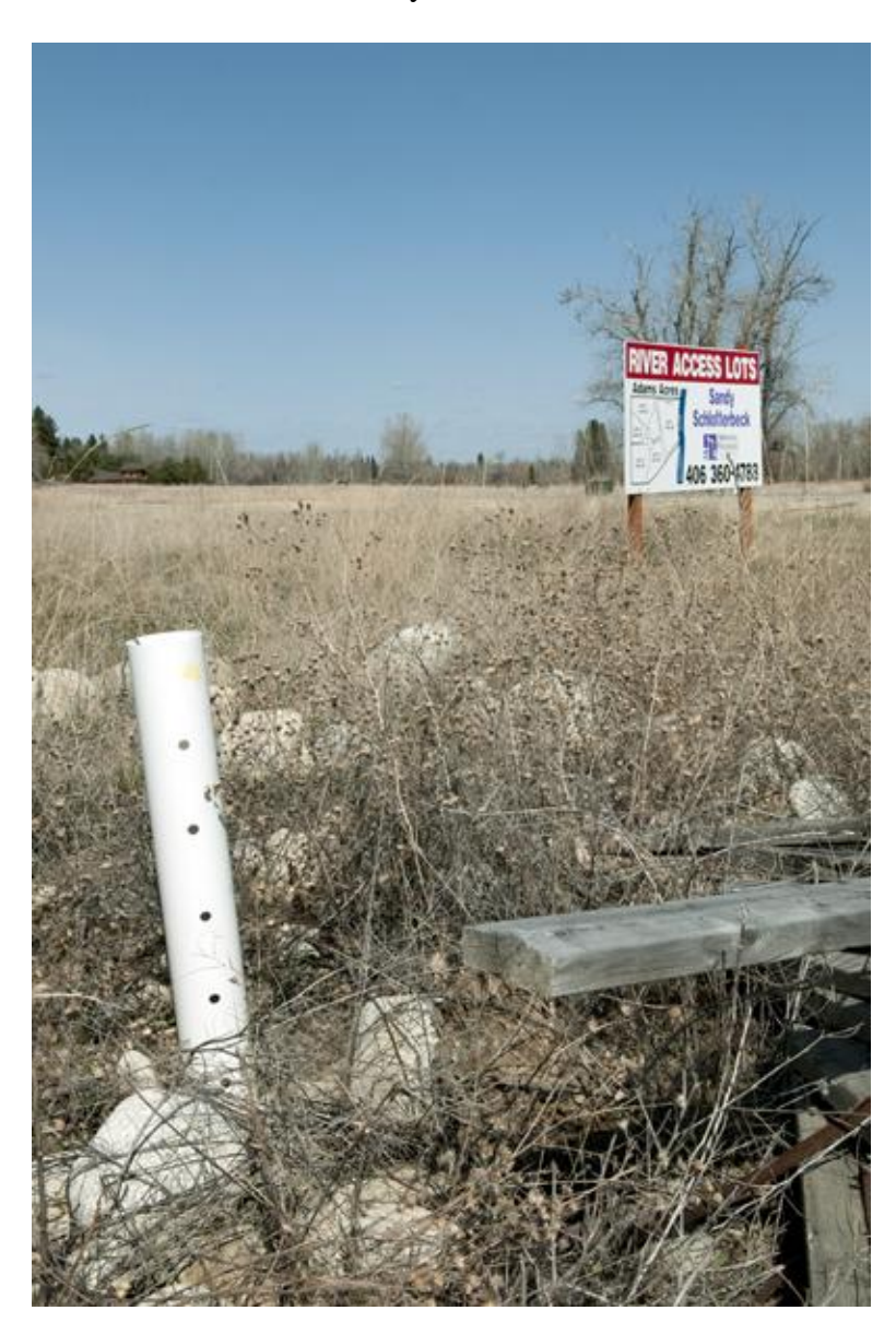
The remnant of a test well gathers knapweed on subdivided land near Hamilton.

If towns like Hamilton can't keep their extra water, the only way to continue growing in a closed basin is to buy water rights from others. But as other water right owners recognize the rarity of water, they know they can ask higher prices. Towns might not be able to afford the water they need.