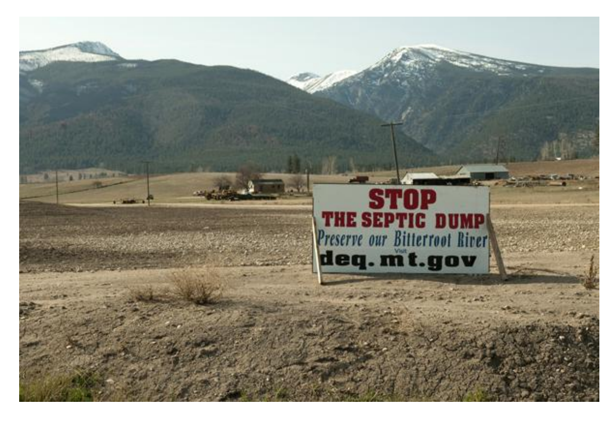
A sign near Stevensville protests one of the problems with septic systems: What to do with the waste?

For now, subdivided lots, each with a separate well, continue to proliferate, and they will for as long as Montana remains attractive to outsiders and as long as Montana water law allows people to drill well upon well without permits. That ultimately means water problems for everyone.