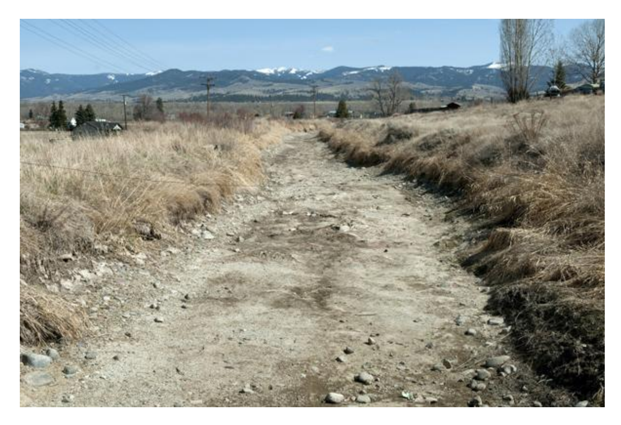
One of the many irrigation canals in the Bitterroot Valley, which flow through areas that are less and less irrigated.

1970. He cannot say how much of that reduction, if any, is caused by human use as opposed to climate change but he thinks dense collections of wells are detrimental. This is especially so where farmland has morphed into subdivisions; the local water table may drop because it is no longer fed by irrigation water. Irrigation has played a dominant role in the Bitterroot Valley for most of the past century.