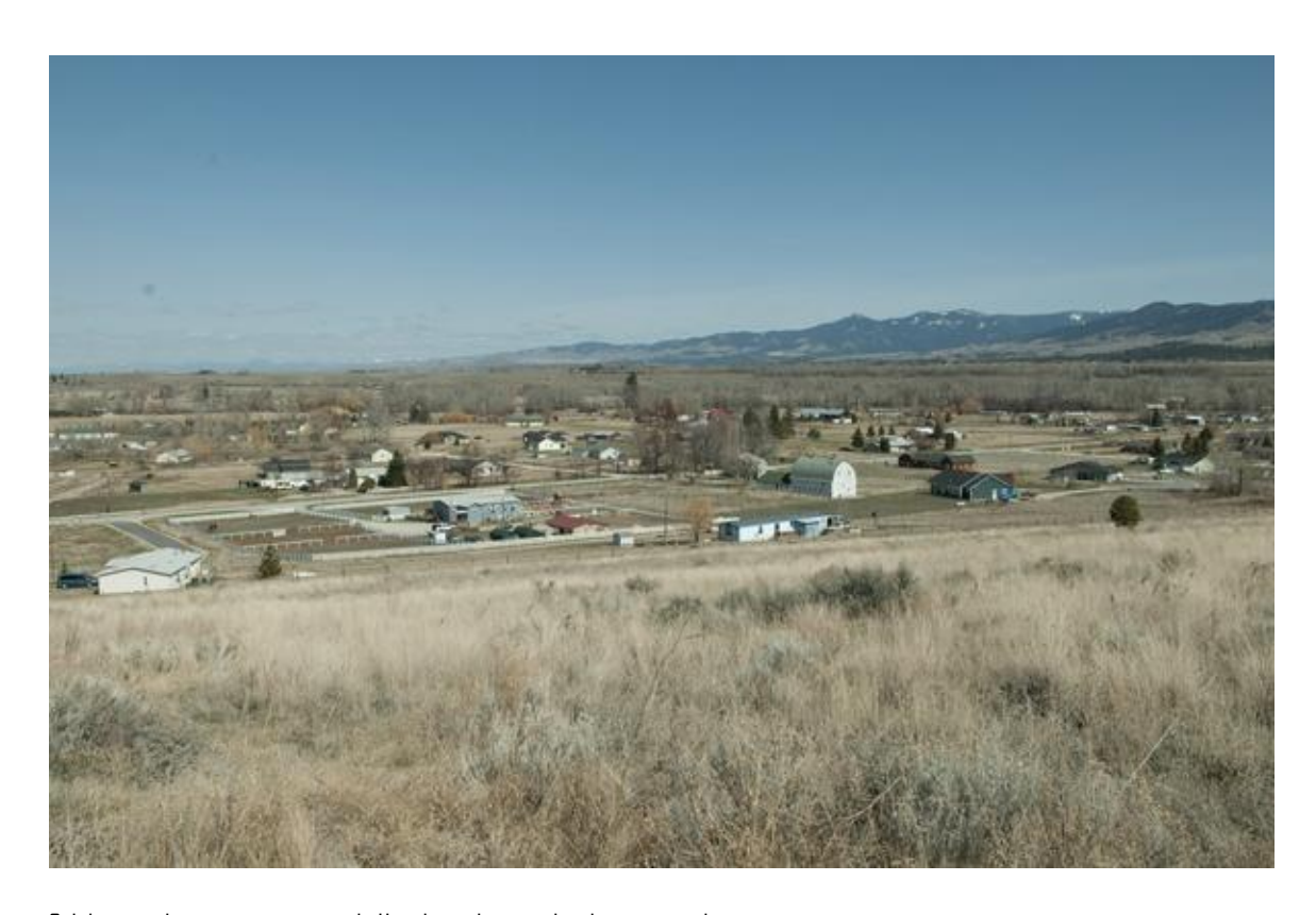
Subdivisions have sprung up outside Hamilton where orchards once stood.

Ravalli County is one of Montana's fastest growing counties. In 1970, the population was 14,409 or approximately 12 people per square mile, concentrated in the valley. At that point, the county didn't have much need for zoning or growth regulation because the population was fairly stable.