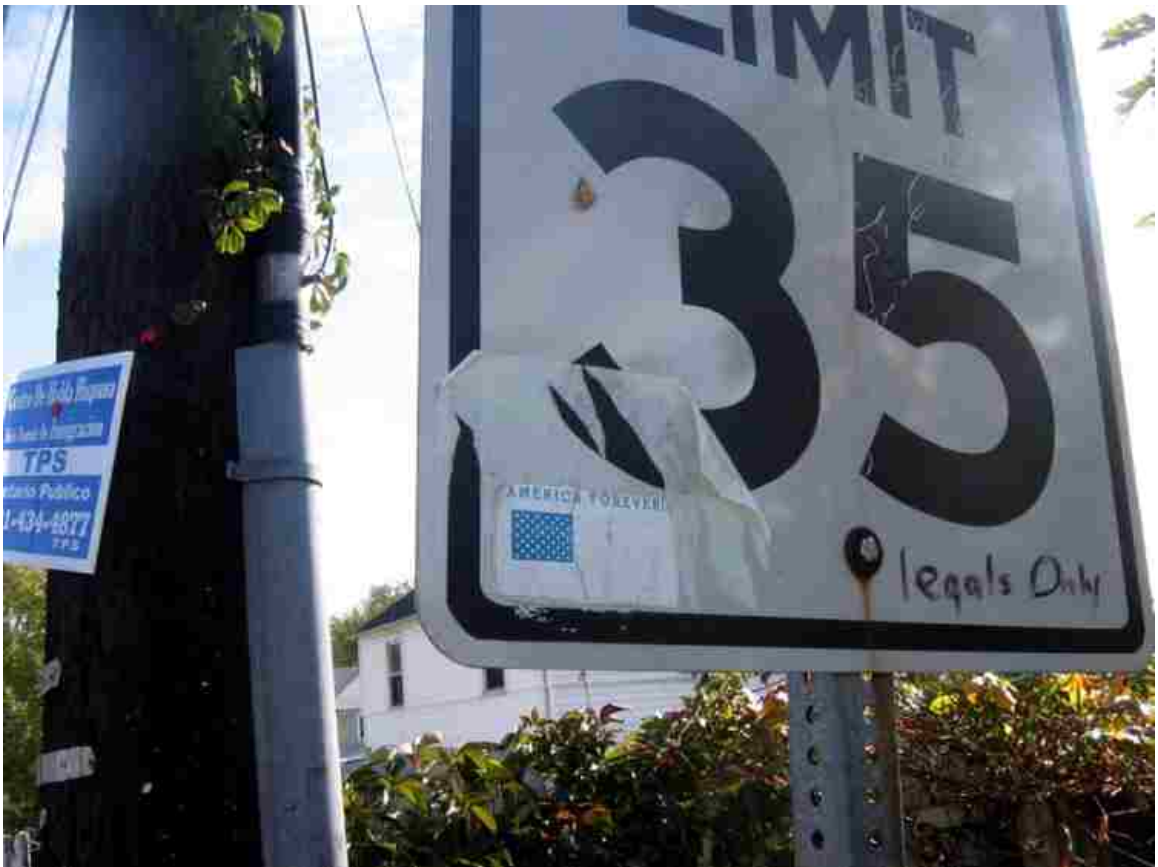
Signs face off at a bus stop in Langley Park, Md., a Salvadoran hotspot just northeast of Washington: The advertisement on the electric pole is from an immigration lawyer hoping to attract Salvadorans who need help with their applications for Temporary Protection Status.