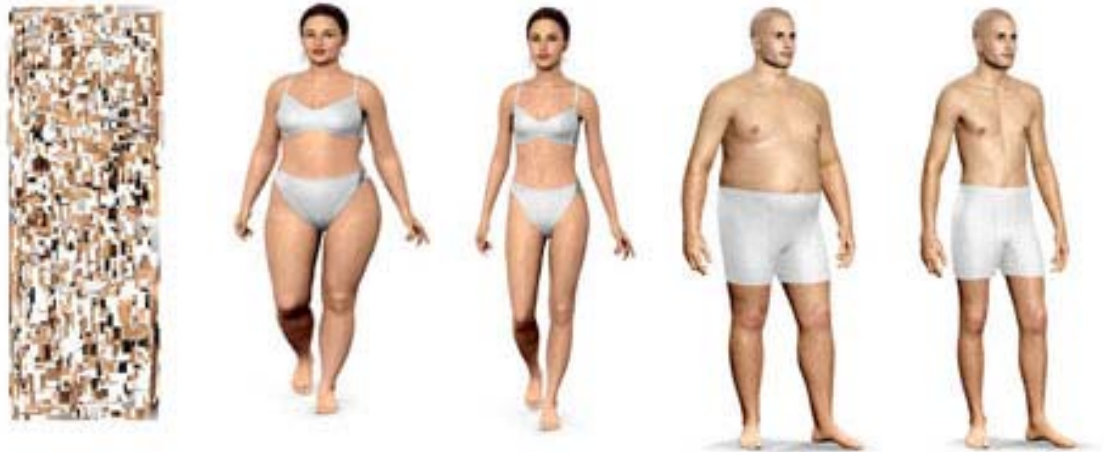
Figure 1: Examples of visual stimuli for males and females

This baseline "resting" period was a non-demanding task that was used to subtract out shared activation from the evaluation condition. Instructions that invite minimally demanding cognitive processing of the rest stimuli kept participants engaged in the task and prevented their minds from wandering and creating random, inconsistent results (Stark & Squire, 2001).