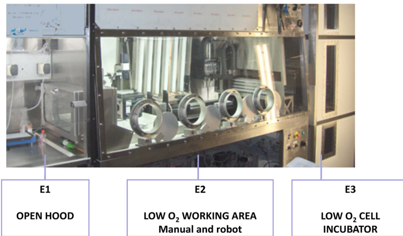
Fig. 2. Low oxygen cell culture platform.

that the mean oxygen level experienced by T cells varies from 1% to 10% according to their localization (Larbi et al., 2010). Culturing T cells at physiological oxygen concentration (5%) generates cellular responses closer to those detected in vivo (Atkuri et al., 2007). In order to detect new biomarkers of T cell ageing, we studied gene expression changes following activation of T cells cultured under atmospheric or physiological oxygen pressure.