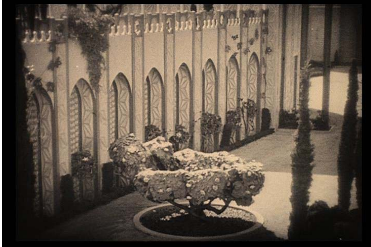
Figure 7. The garden scene of the 1924 Thief with the rose tree prominently in the center.