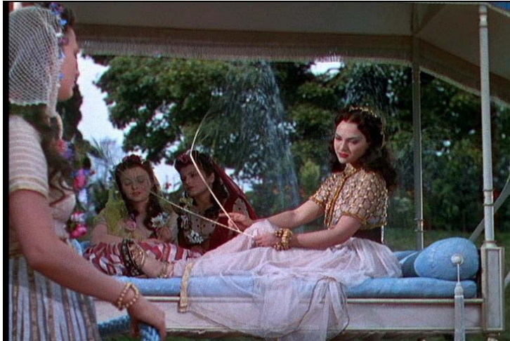
Figure 10. A third angle of the 1940 garden scene, showcasing its immense size.

While Korda certainly foreignized scenic elements of his film, he also created foreignized characters. The differences between the antagonists of the 1924 and 1940 films is very telling. In the 1924 American film the enemy is represented by a Mongol Prince, played by the Japanese actor Sojin, who comes to Bagdad as one of the suitors for the princess (see fig. 9). When she refuses him, he decides to take over the city of Bagdad by force with his Mongol soldiers. This invasion of the “bad guys” and the ensuing conflict of sword against sword is an interesting spin on the American Western struggle between cowboys and Indians. Hollywood Westerns of the early twentieth century often contained some variation of the conflict between whites and Native Americans, with the latter often ostensibly attacking the former. The Mongol invasion of this film looks and feels a lot like the conflict between cowboys and Indians. While the other is different (the enemy is Mongolian rather than Native American), the dichotomy is the same. Fairbanks even had racially-determined stipulations of difference: his bad guy looked significantly different from the other actors.