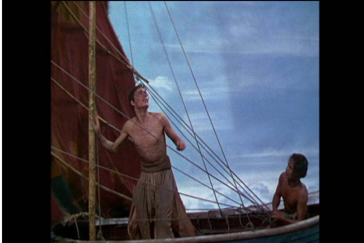
Figure 6. Prince Ahmed and Abu travel to Basra by boat in the 1940 Thief .

Another major element of scenic difference that Korda emphasizes is that of the garden imagery. Britain is well known for its gardens, and the British garden is an iconic part of the culture. Thus Korda jumped on the chance to create a gorgeous garden for his film. The garden setting of the American 1924 film has a few sparse bushes and one large rose tree (see fig. 5), but Korda's garden distinguishes itself with dark green foliage, large sweeping trees, a vast pool and a classical columned structure (see figs. 6, 7, 8). The 1940 film can almost be heard to scoff at its 1924 predecessor, "You call that a garden? We'll show you a garden," one complete with flamingos, bright flowers and lush greenery. Because Walsh had only directed American Western films up until this point, presumably the garden wouldn't have had very high priority in his mind. Furthermore, American film had frequently associated itself the cowboy image, and, by extension, the deserts of California and Kanab, Utah. Because the setting for the American cowboy film was most often the desert, Korda could easily highlight the difference between the lush, verdant England and the desert image of America popularized by cowboy movies. Because it was a weak point in the American film, it was easy to exploit in the British foreignization.