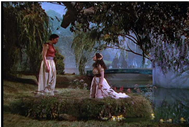
Figure 8. The garden scene of the 1940 Thief .