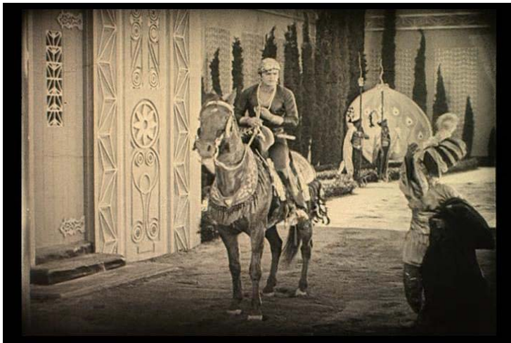
Figure 5. Douglas Fairbanks on horseback in the 1924 Thief .