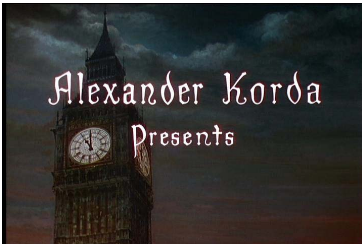
Figure 1. The opening credits of Korda's 1940 The Thief of Bagdad .