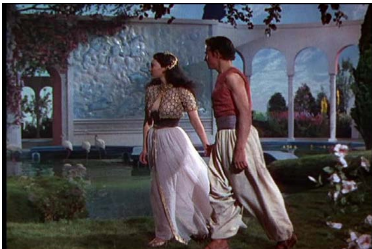
Figure 9. Another view of the 1940 garden scene. Note the live flamingos in the background.