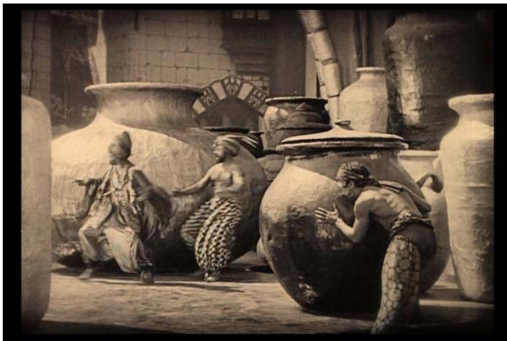
Figure 2. Douglas Fairbanks as the thief in the 1924 film.

the one character into two—a prince and a thief. The American version deals with themes of social mobility because Fairbanks' rise from thief to prince represents the potential of any ambitious dreamer (see fig. 11). Korda's version, on the other hand, begins with a prince who is betrayed by his royal advisor and has to work his way back up to his rightful place on the throne. The action of the British film focuses on Ahmed's struggle to regain his kingdom and win the princess, while the thief Abu, played by child actor Sabu, takes a secondary position as more of a comic relief character (see fig. 12). The American film is about meritocracy—the British film, about aristocracy. While both films have a thief and are titled The Thief of Bagdad , Korda's film relegates the role of the thief to a juvenile one, emphasizing its difference from the 1924 rags-to-riches, "American dream" story where happiness can be earned, and where every thief is a potential prince. In Fairbanks' film, the thief can earn a fortune, get a change of clothes and then become a prince. In reaction to this, Korda deliberately keeps his social classes more rigid. His film deals with the nuances of monarchical rule, the political balance of power, and the danger of corrupt advisors.