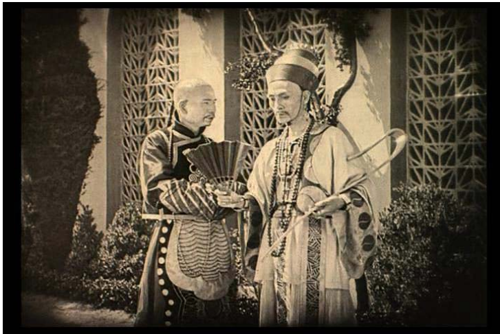
Figure 11. The treacherous Mongol prince (Sojin) and his advisor (1924).

plot here is significant, for it allows Korda to deal more heavily with themes of the royal right to power, complications of those rights, the idea of corruption in high places, and the image of noble royalty betrayed by evil advisors. Jaffar, played by Conrad Veidt, makes the ultimate European bad guy because he is an abuser of his political power. By 1940 Veidt had become known for playing Nazi spies. He played a spy in I Was a Spy (1933) and again in The Spy in Black (1939), and was later to play the German Major Strasser in Casablanca (1942). He was, at least for European audiences, a recognizable bad guy, and more importantly, he had played the usurper of legitimate political power. His physical appearance makes his espionage and subterfuge all the more insidious because, unlike the Japanese actor Sojin of the American film, Veidt blends in with the rest of the white British actors. Korda's 1940 version offered a sophisticated alternative to the Hollywood black-and-white conflict.