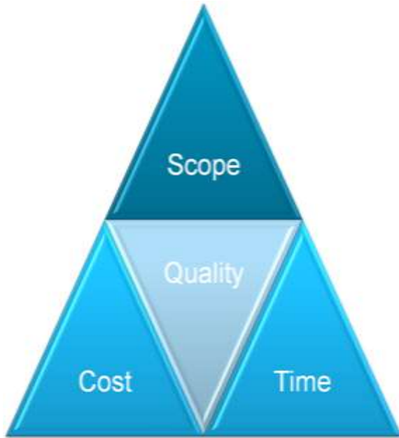
Figure 1. Standard project management constraints.