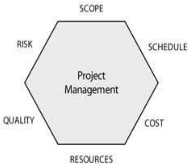
Figure 2. Project Management Constraints