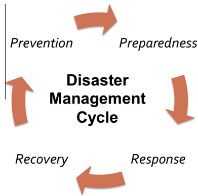
Fig. 1. Phases of the disaster management cycle.

A disaster can be defined as a “serious disruption of the functioning of a community or a society involving widespread human, material, economic or environmental losses and impacts, which exceeds the ability of the affected community or society to cope using its own resources” (UN International Strategy for Disaster Reduction, 2009, p. 9). Although attention and resources are concentrated on responding to disasters, the disaster management cycle (Fig. 1) is commonly conceptualized as having four overlapping and interconnected phases focusing on risk management ( prevention and preparedness phases) and crisis management ( response and recovery phases) (Alexander, 2002, p. 6). Together these phases represent the “sum total of all activities, programs and measures which can be taken up before, during and after a disaster with the purpose to avoid a disaster, reduce its impact or recover from its losses” (Vasilescu et al., 2008, p. 46).