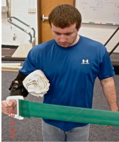
Figure 7. Starting Position of Standing External Rotation With a Towel Roll.