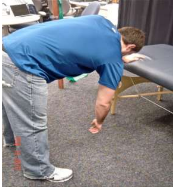
Figure 14. Position of Pendulum. The subjects performed the pendulum motions in clockwise and counterclockwise directions.