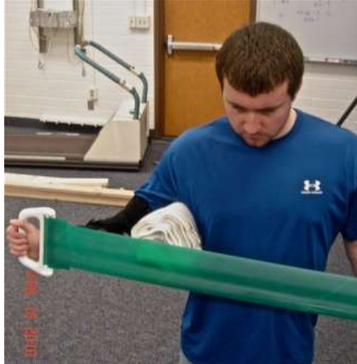
Figure 8. End of Concentric Phase of Standing External Rotation With a Towel Roll.