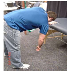
Figure 6. Pendulum

For both step 1 and 2, the subjects will hold a 1-lb dumbbell and perform 1 set of 20 repetitions.