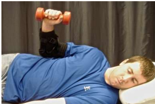
Figure 10. End of Concentric Phase of Sidelying External Rotation Alone.