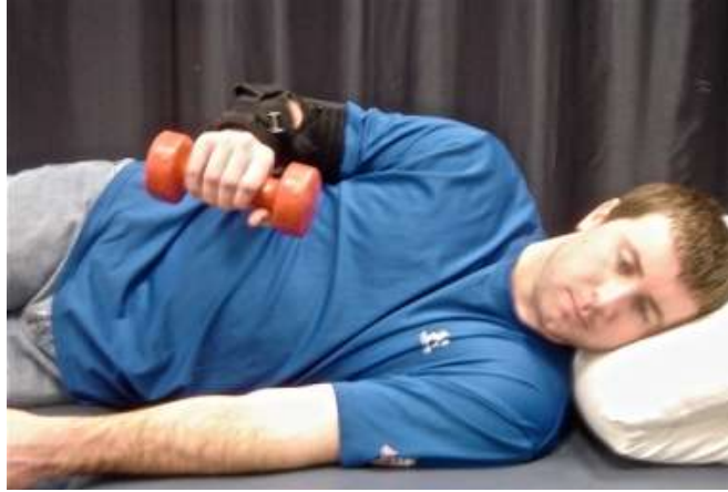
Figure 9. Starting Position of Sidelying External Rotation Alone.