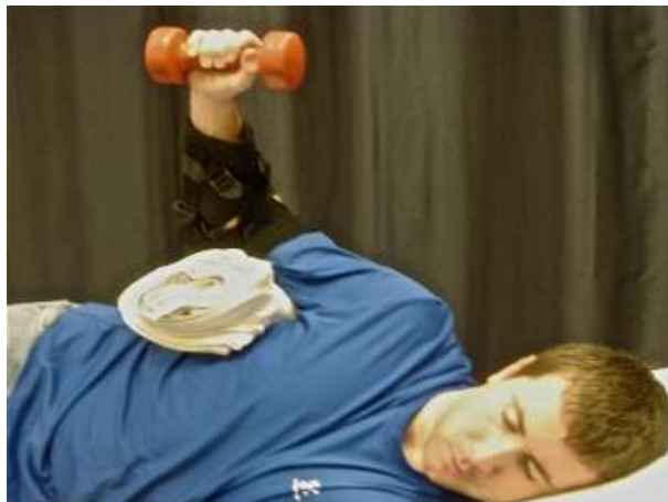
Figure 12. End of Concentric Phase of Sidelying External Rotation With a Towel Roll.