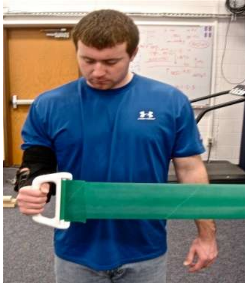
Figure 5. Starting Position of Standing External Rotation Alone.