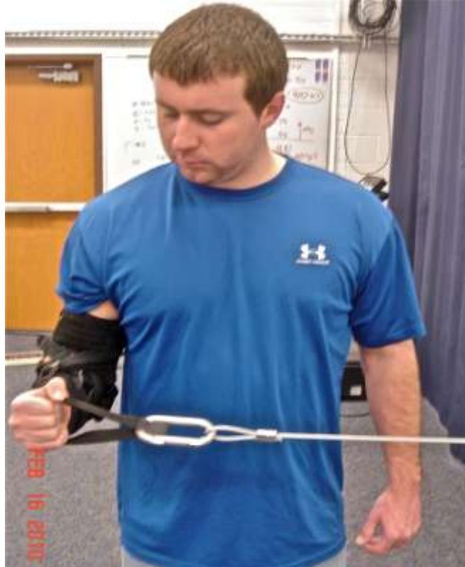
Figure 3. MVIC Position of the Infraspinatus. The shoulder was abducted to 0° with neutral shoulder rotation, and the elbow fixed to 90°. The subject pulled a cable in the external rotation direction, in order to create a shoulder external rotation force.