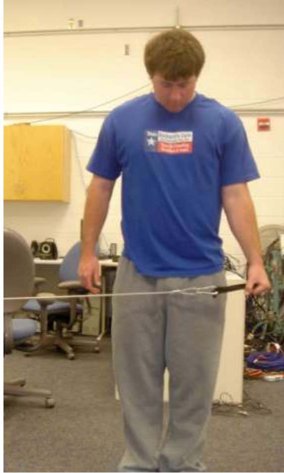
Figure 1. MVIC Position of the Middle Deltoid. The shoulder was abducted to 0^{\circ} , and the subjects pulled a cable laterally, in order to create a shoulder abduction force.