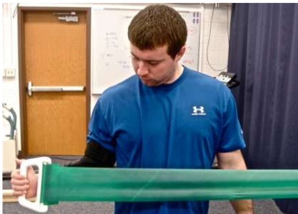
Figure 6. End of Concentric Phase of Standing External Rotation Alone.