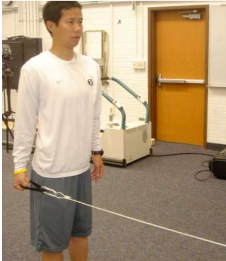
Figure 2. MVIC Position of the Posterior Deltoid. The shoulder was abducted to 0^{\circ} , and the subjects pulled back a cable, in order to create a shoulder extension force.