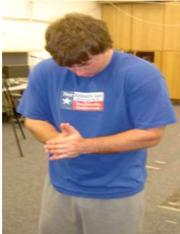
Figure 4. MVIC Posture of the Pectoralis Major. The shoulders were bilaterally abducted to 0° bilaterally with the palmar surfaces of the hands together, and the elbows were flexed to 90°. Subjects pressed the palmar surfaces of the hands against each other.