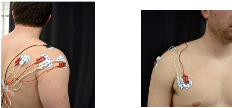
Figure 5. Electrode Placements

will be used to record surface EMG activity. The electrodes will be placed over four muscles: the middle and posterior deltoid, the infraspinatus, and the sternal part of the pectoralis major. The locations of the electrodes will be over the central portion of the muscle bellies. 97 For the middle deltoid, the electrodes will be positioned 3 cm below the acromion process over the muscle mass on the lateral upper arm. For the posterior deltoid, 2 cm inferior to the lateral border of the scapular spine, and the electrodes will be angled parallel to the muscle fibers. For the infraspinatus, the electrodes will be positioned 4 cm inferior and parallel to the scapular spine on the lateral aspect over the infrascapular fossa. For the sternal part of the pectoralis major, the electrodes will be placed horizontally on the chest wall over the middle part of the pectoralis major, 2 cm from the axillary fold. A ground electrode will be positioned over the acromion process on the same side of shoulder. The same tester will place the electrodes on all subjects in order to maintain consistency (Figure 5).