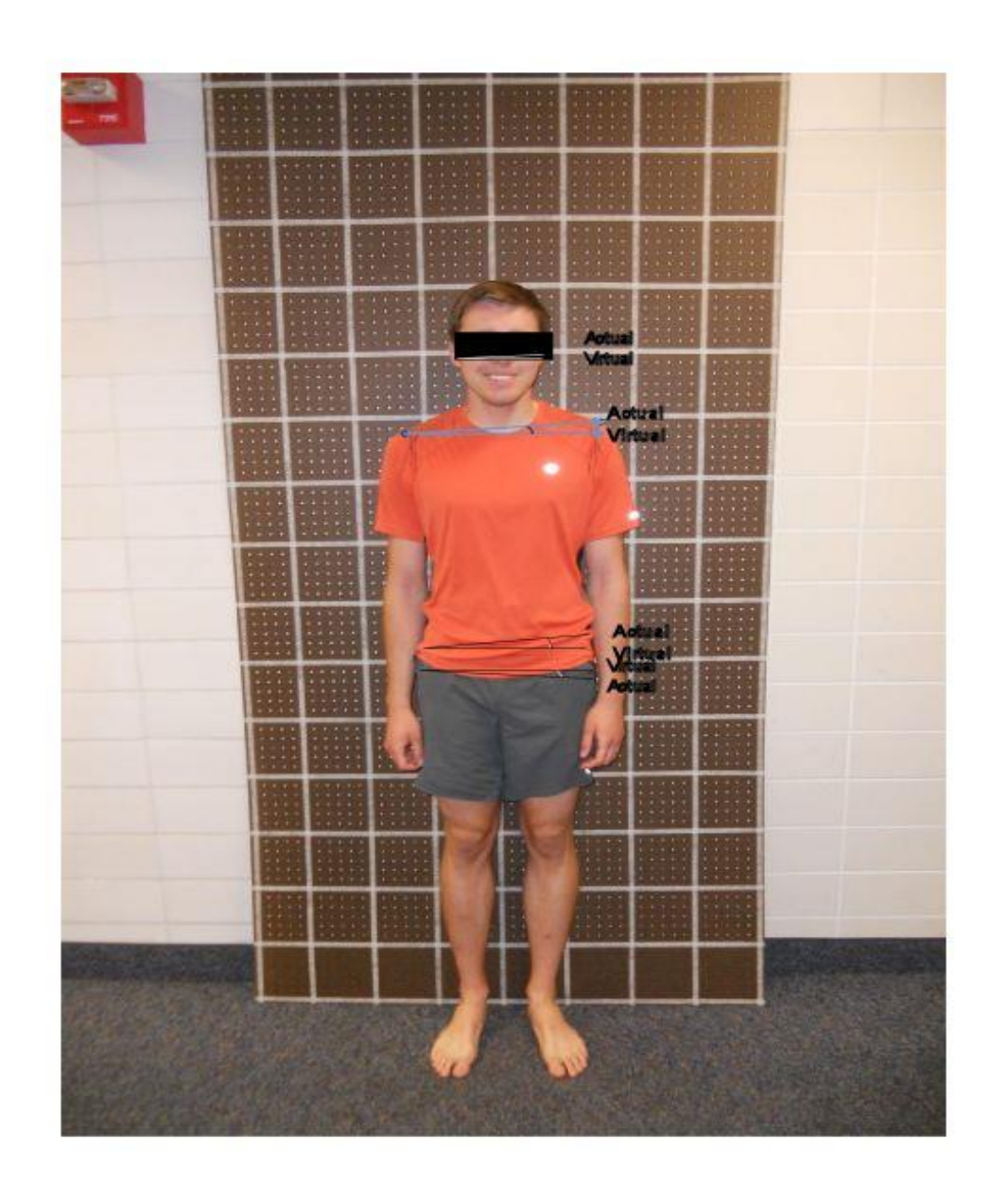
Figure 2. Example of angle calculations