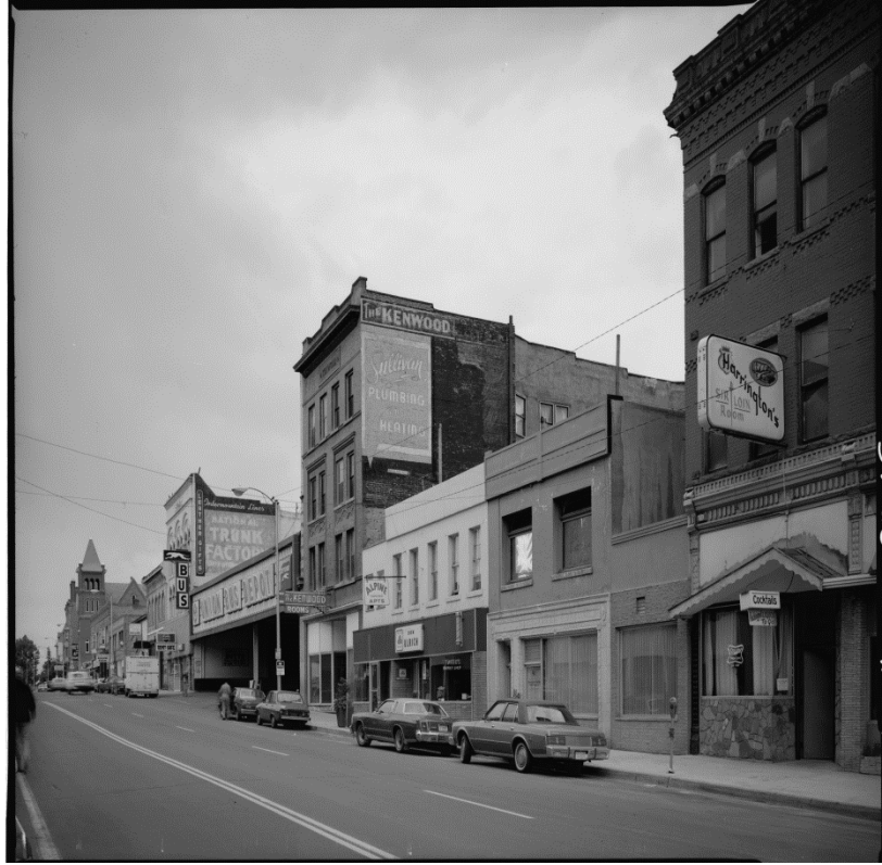
Figure 6. Butte's Uptown, looking West on Broadway Street, circa 1980.