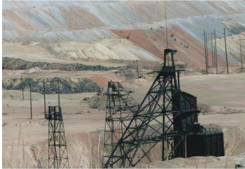
Figure 7. The view from the Granite Mountain Memorial, looking east.

provides some information about the lives of miners, the focus remains on the industrial landscape and artifacts. 218