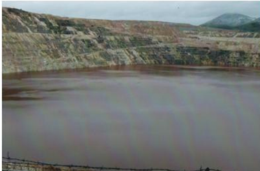
Figure 4. The Berkeley Pit today.

average, while deaths due to Alzheimer's disease were more than double. Again, there is a correlation between exposure to toxins present in Butte and incidences of these diseases. 188 Barry concludes that remediation has been unsuccessful in protecting the health of Butte's citizens. She accuses the EPA of failing to conduct adequate risk assessments by ignoring contaminants such as aluminum and mercury and testing only small areas of the city. Barry, however, also blames Butte for ignoring risks in order to present an improved public image, particularly to tourists. 189