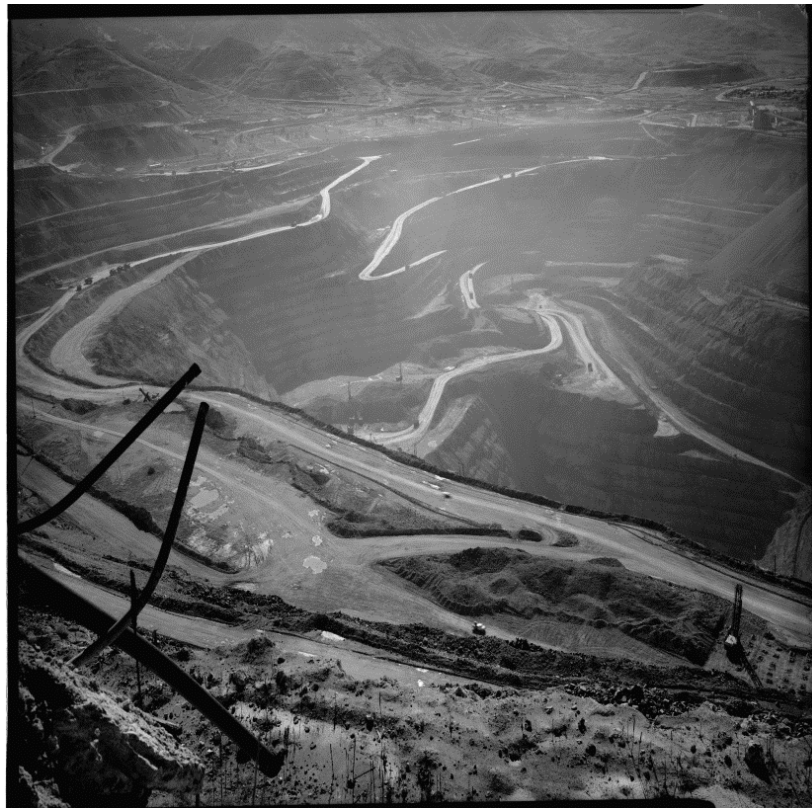
Figure 3. The Berkeley Pit in operation, circa 1980.

significant section of the town in order to sustain the mining industry. The increased mechanization and efficiency of open-pit mining required far fewer workers than traditional underground mines, and from 1960 to 1976, mining jobs declined from over 6,000 to 2,200. Between 1960 and 1970, nearly 8,000 individuals left Silver Bow County. 82 Because of this exodus of former miners and the resulting economic turmoil, Butte residents believed that an expansion of the mining industry was the only way to insure the economic survival of the town.