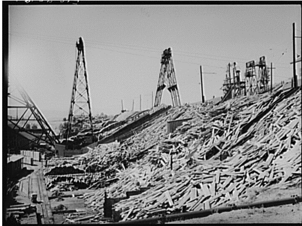
Figure 2. The timberyard of Butte's Mountain Con mine, 1942.

materials left after the smelting process) indiscriminately, contaminating both the hill and low-lying areas in the valley. Spring floods and heavy rains washed thousands of tons of mine waste down Silver Bow Creek and into the Clark Fork River, depositing the metal-rich tailings along the floodplain. 44