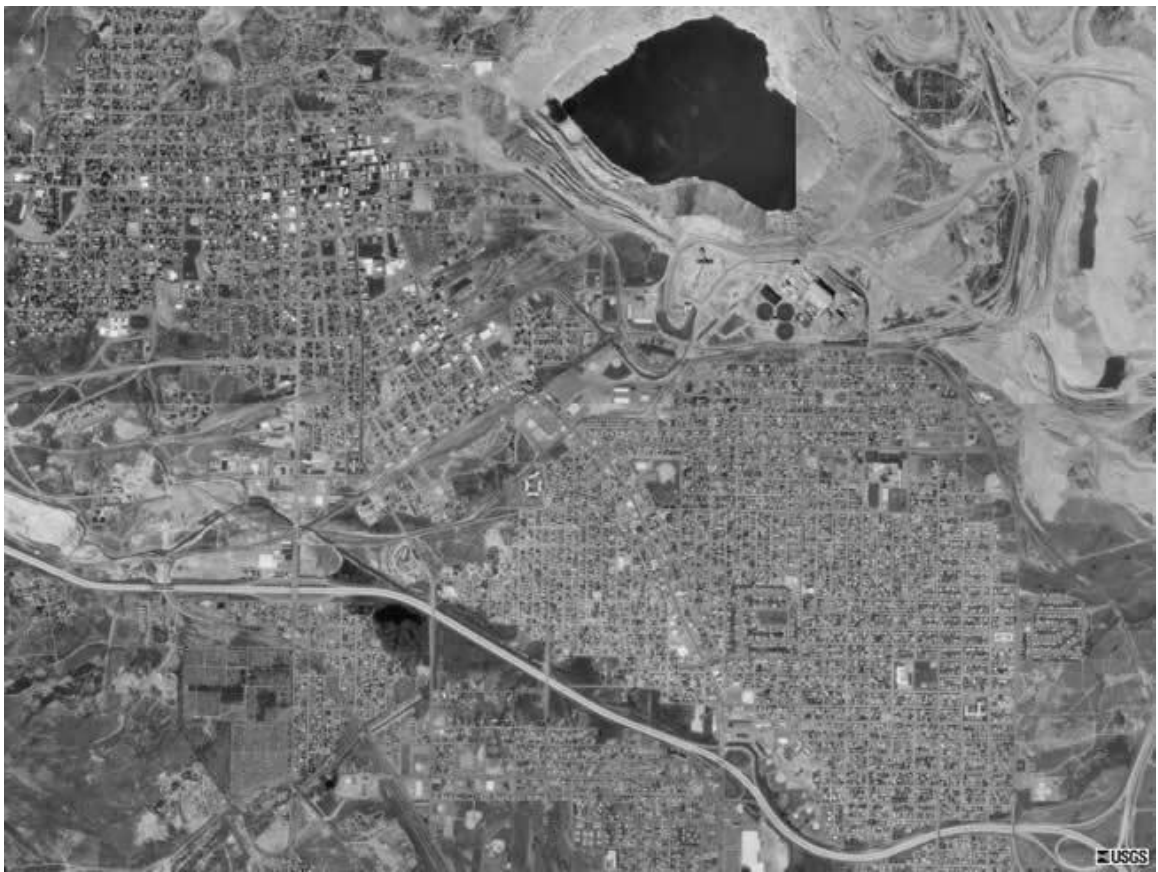
Figure 1. An aerial photo of Butte, looking north. The Berkeley Pit is seen at the top right, with Uptown to the left of the Pit. Interstate 90 is visible along the bottom of the photo. (United States Geological Survey)

houses sit next to renovated storefronts. Businesses invoke the area's mining history with names such as Quarry Brewing Company and Copper City Signs and Awnings, while the east-west streets are named for metals: Aluminum, Copper, Mercury, Silver. Hidden under the streets are nearly 10,000 miles of mining tunnels, connecting more than thirty vertical shafts. 5 A map of the mine tunnels looks like an out-of-control Etch-A-Sketch drawing, with hundreds of lines crisscrossing and overlapping.